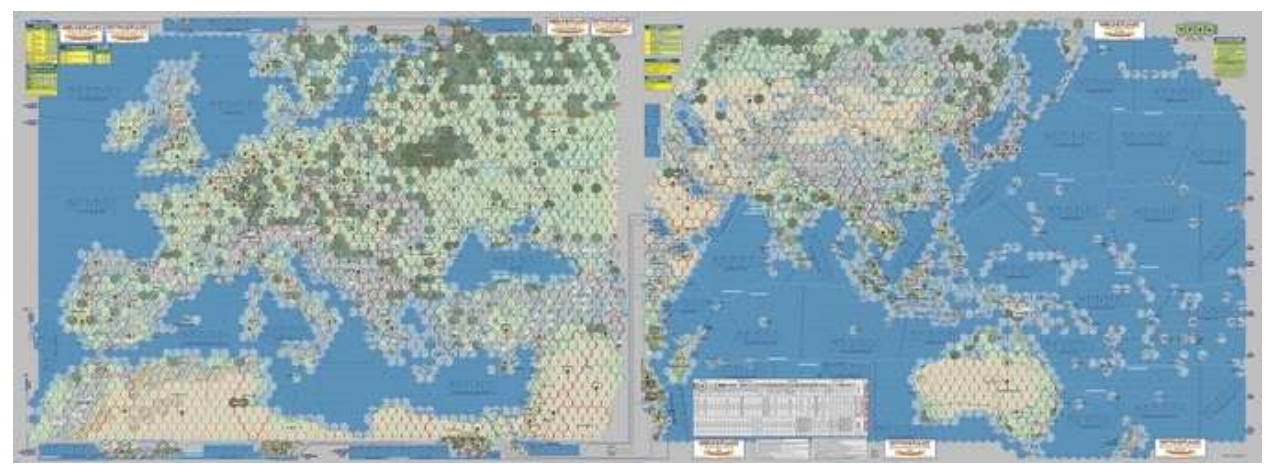
World in Flames main maps (0.850mtrs x 2.297mtrs)

World in Flames: the Collector's edition is an international award-winning global game of World War II. Starting in 1939 with the only forces at your disposal ravaged by the Depression, you, as the leader of your nation, must guide your people through the dark horrors of war to the ultimate fruits of final victory.