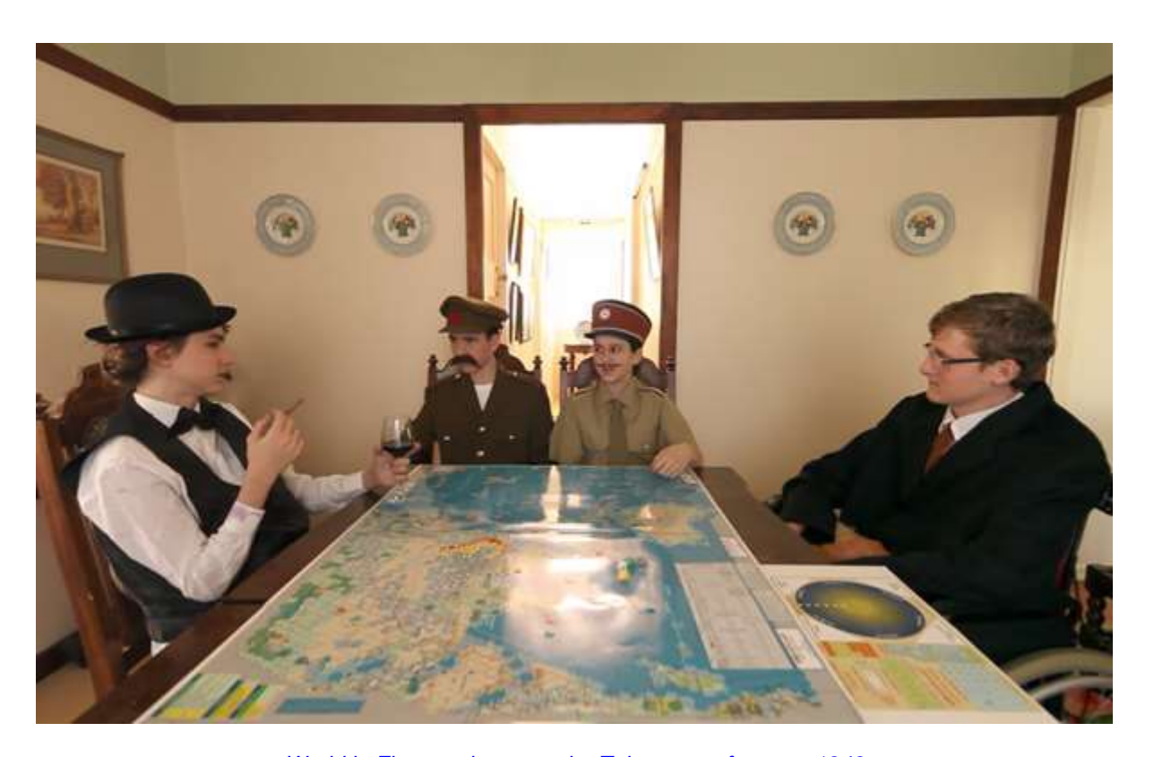
World in Flames players at the Teheran conference, 1943

https://www.guinnessworldrecords.com/world-records/largest-board-game-commercially-available/