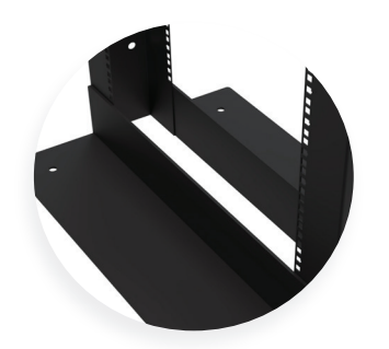
BASE CAPABLE OF ANCHORING TO FLOORS