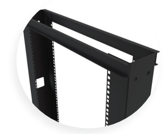
TWO 4" INTERNAL VERTICAL CABLE CHANNELS