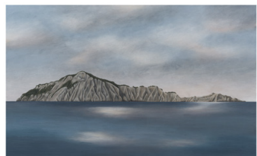
Bare Island from Waimarama Te Motu-o-Kura