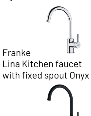
Franke Lina Kitchen faucet with fixed spout Onyx