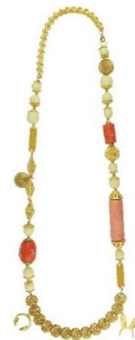
Long chain with various charms