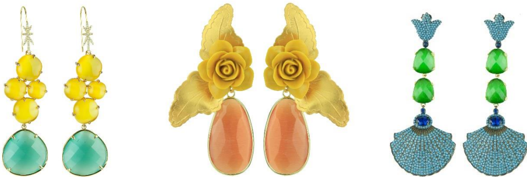
Gold plated earrings with crystals and faceted cat's eye Leaf earrings with resin flower and faceted cat's eye.