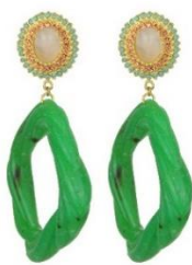
Carved resin hoops