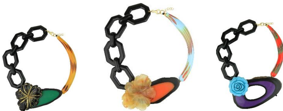
Short necklace with acrylic, resin, Murano glass