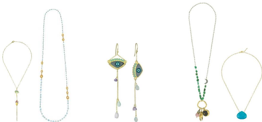
Various gold plated 925 silver necklaces with stones and earrings