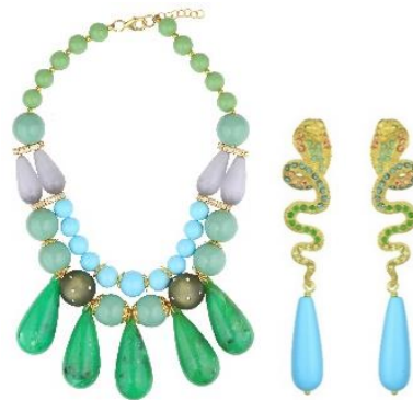
Short necklace with turquoise and beads