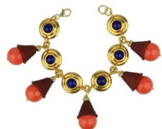
Various charm bracelets