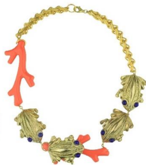
Necklace with vintage turtles