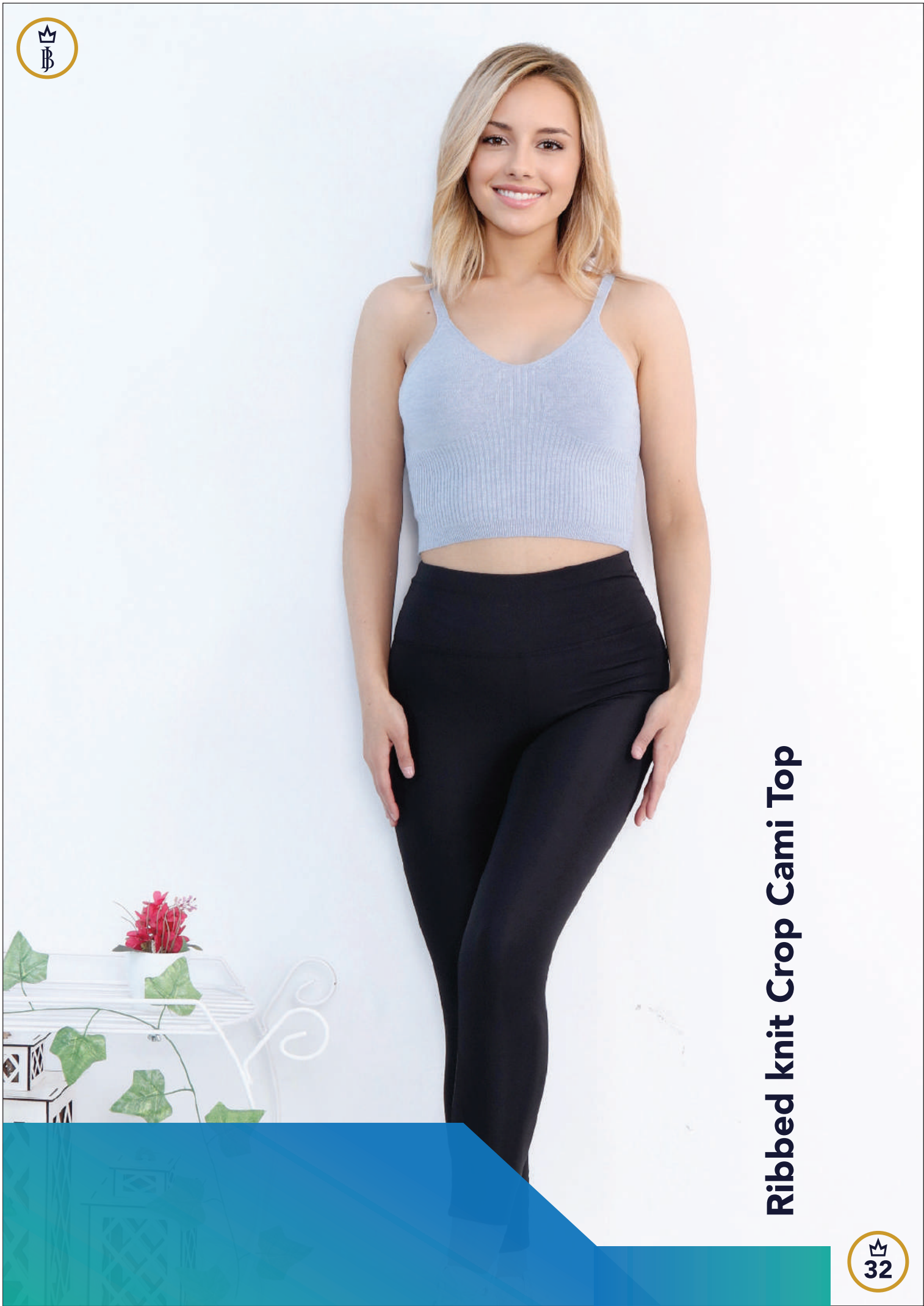
Ribbed knit Crop Cami Top