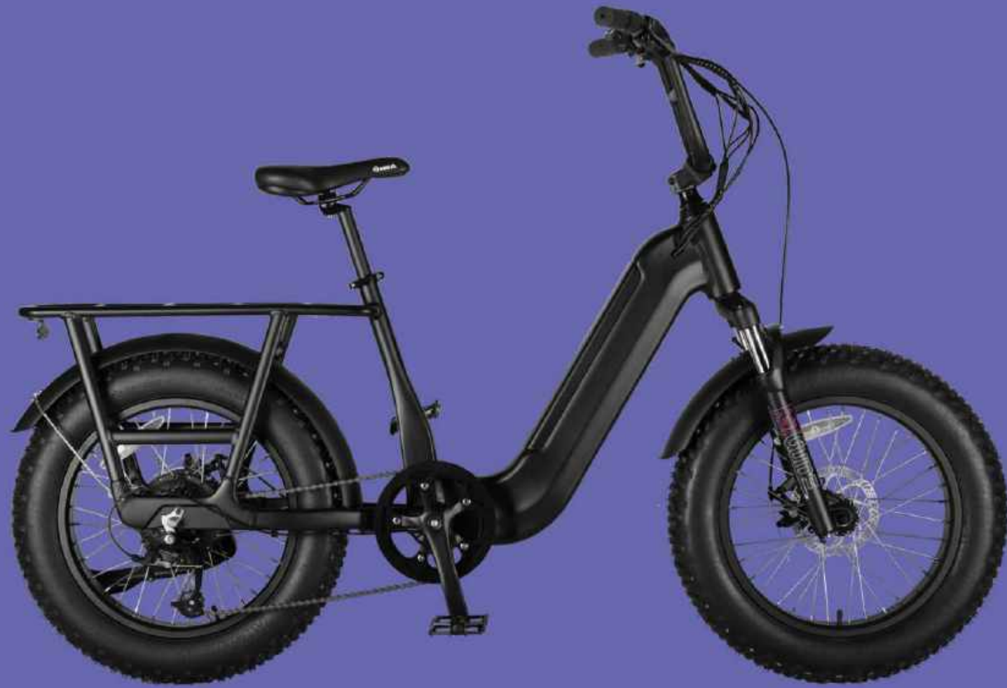
DFT-2012 PIZZA EBIKE