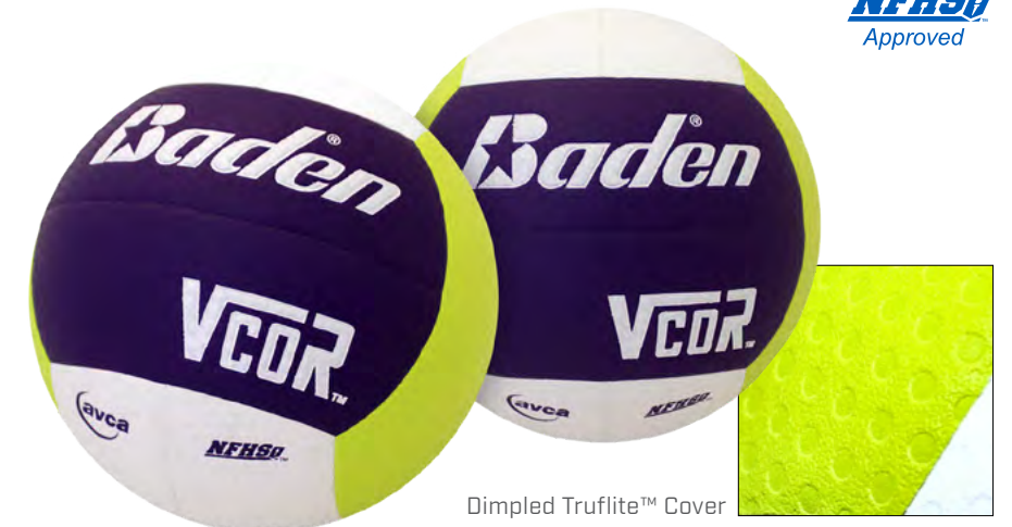
Dimpled Truflite™ Cover