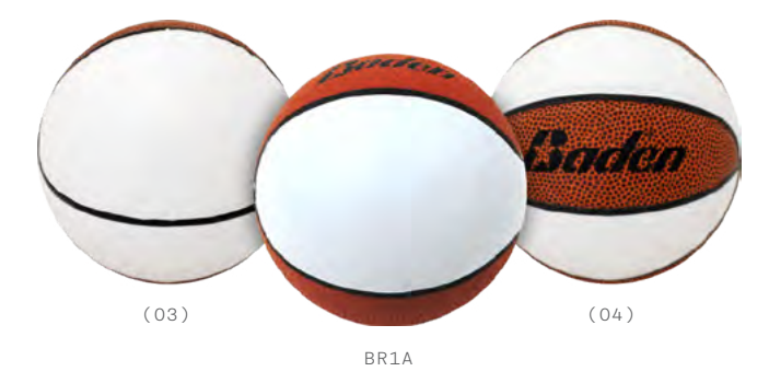
(03) BR1A (04)