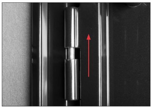
The door must be clear of frame for removal. Lift straight up to avoid damaging bolts.

THE SAFE DOOR IS HEAVY AND CAN BE AS MUCH AS <sup>1</sup>/<sub>3</sub> OF THE TOTAL WEIGHT OF THE SAFE. SHOULD YOU CHOOSE TO REMOVE IT, BE SURE TO HAVE ENOUGH PEOPLE HELP SUPPORT THE WEIGHT OF THE DOOR AND CARE SHOULD BE TAKEN TO AVOID DROPPING IT, WHICH COULD CAUSE DAMAGE OR PERSONAL INJURY TO YOURSELF OR OTHERS. FAILURE TO FOLLOW THIS WARNING COULD RESULT IN SERIOUS INJURY OR DEATH.