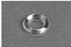
FR - Forever Ring