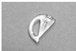
LI - Level Lock Insert