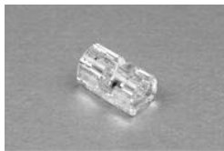
RL - Ring Lock