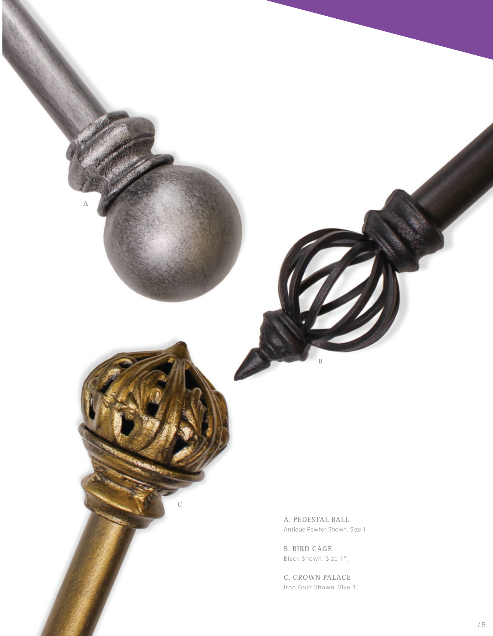
A. PEDESTAL BALL Antique Pewter Shown. Size 1".