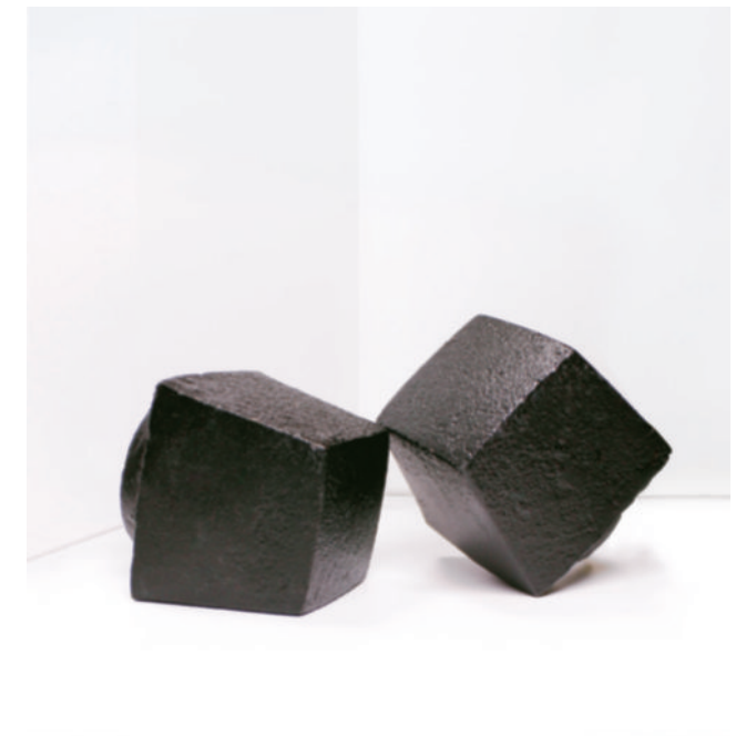
PETITE FAUCET Black Shown. Size 1".