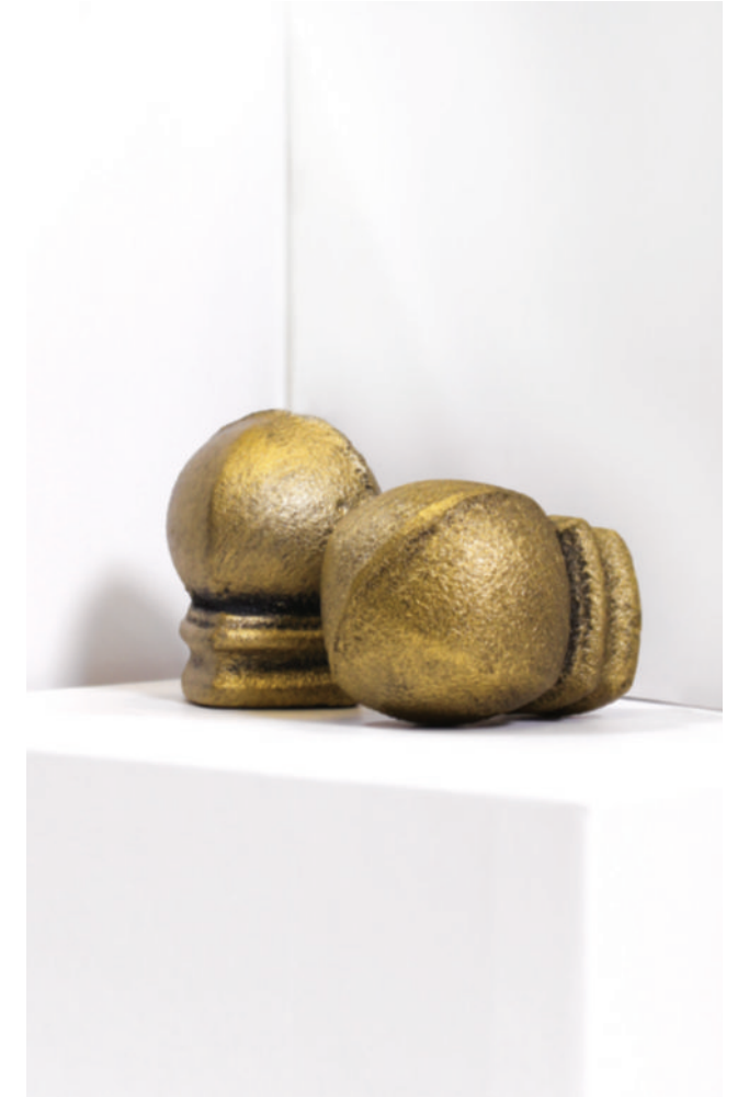
PETITE MODERN BALL Iron Gold Shown. Size 1".