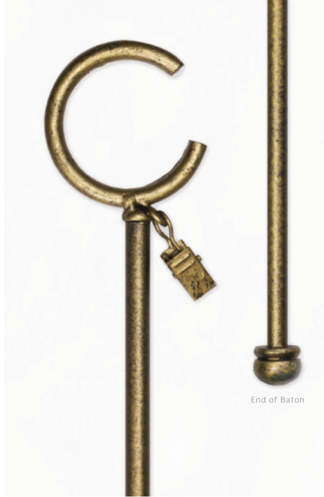
End of Baton