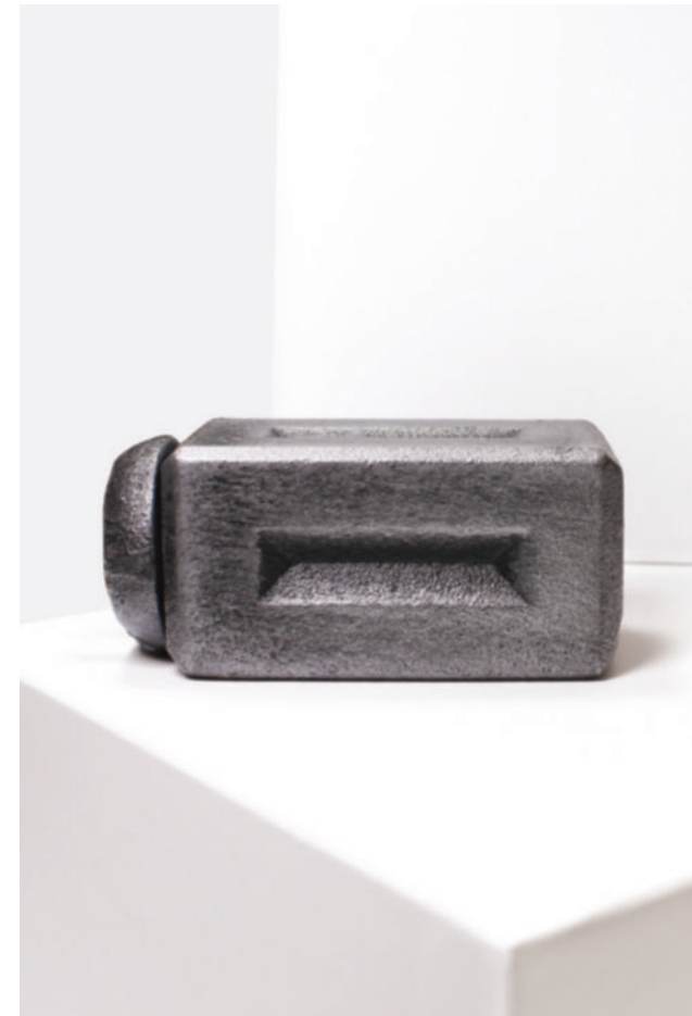
BEVELED BRICK Antique Pewter Shown. Size 1".