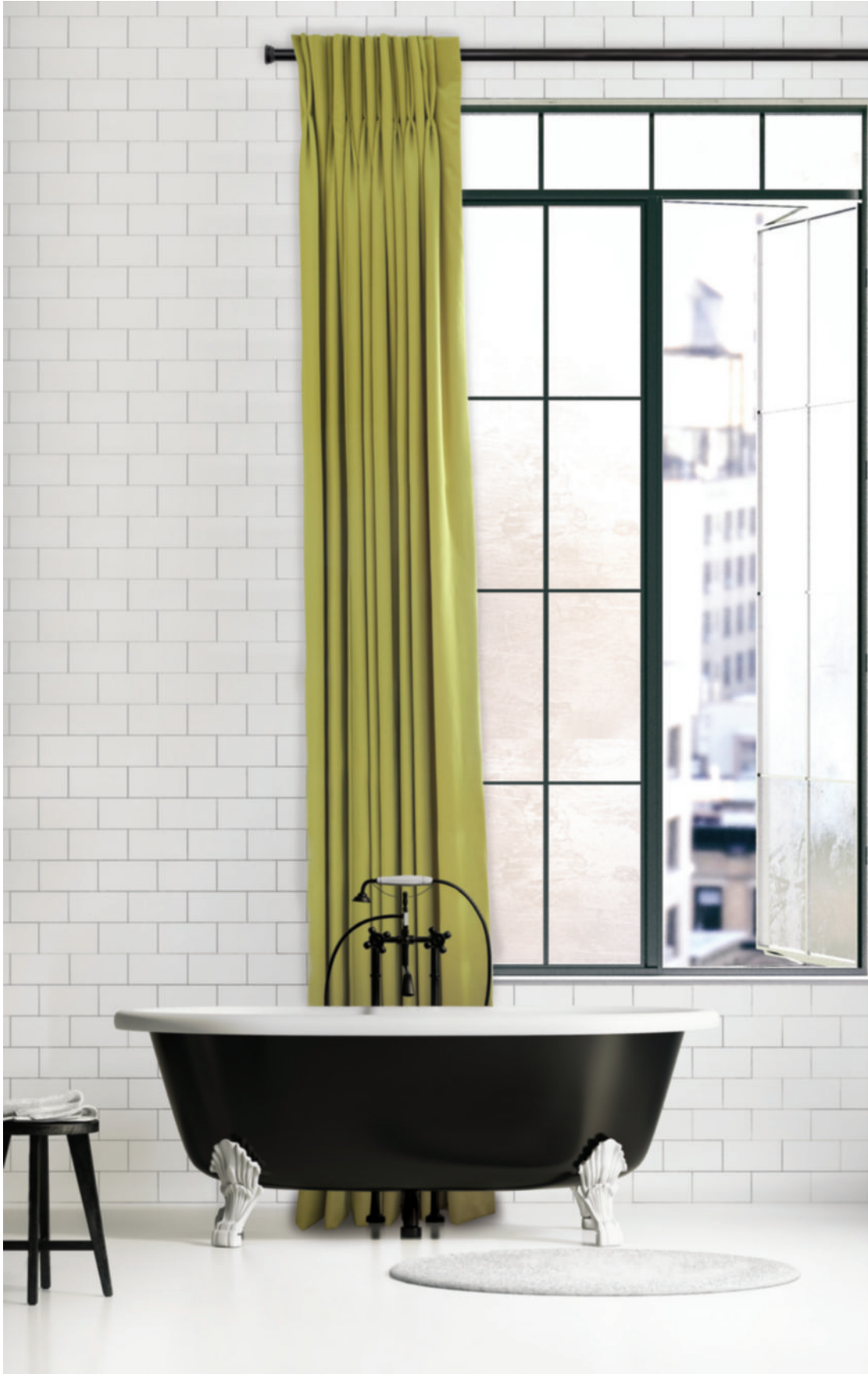
ENDCAP Black Shown