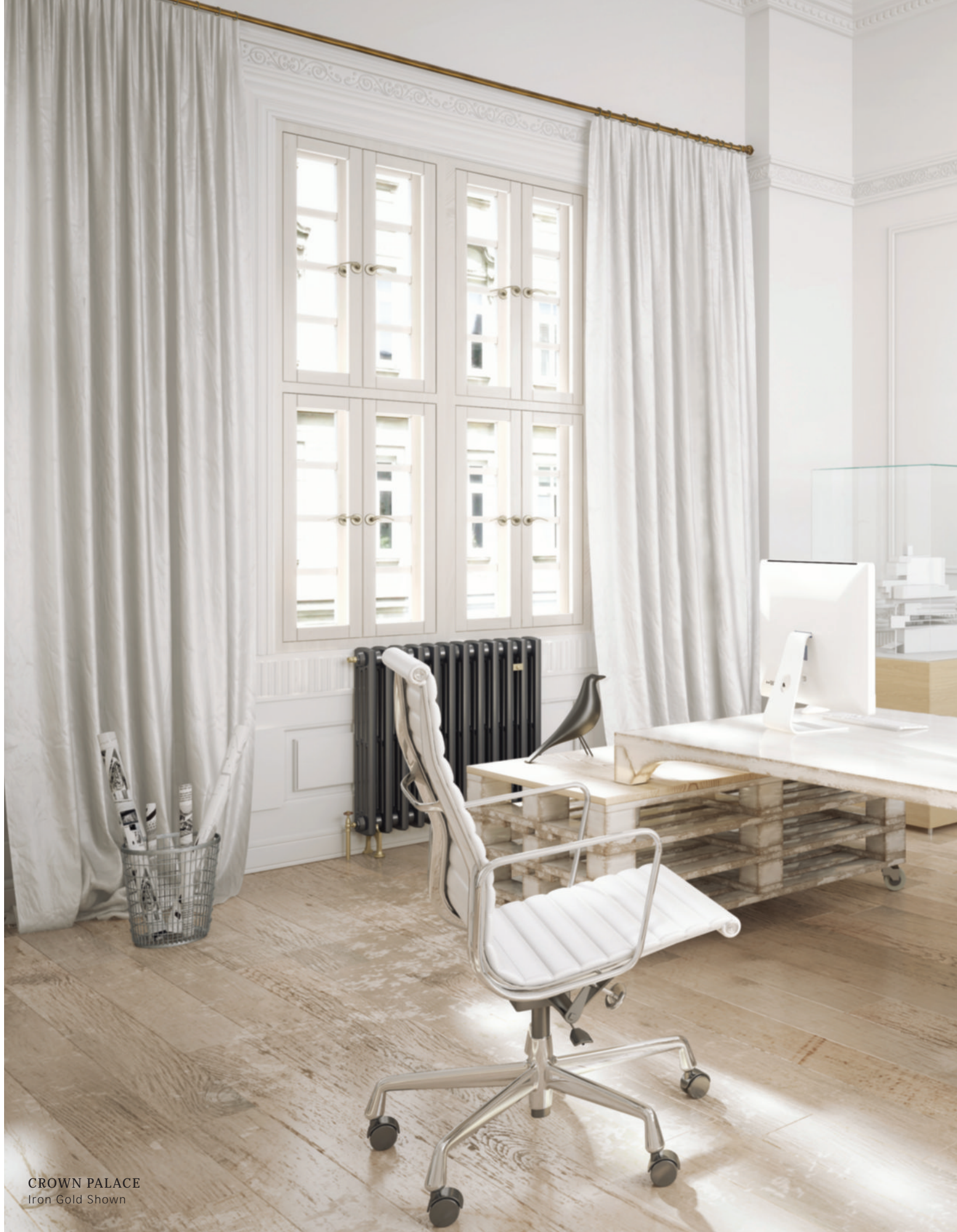
CROWN PALACE Iron Gold Shown