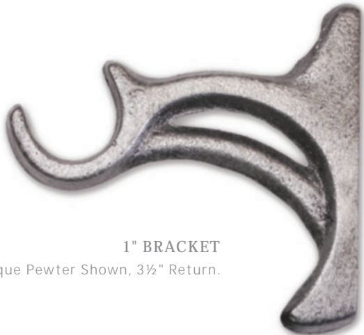
1" BRACKET Antique Pewter Shown, 3½" Return.