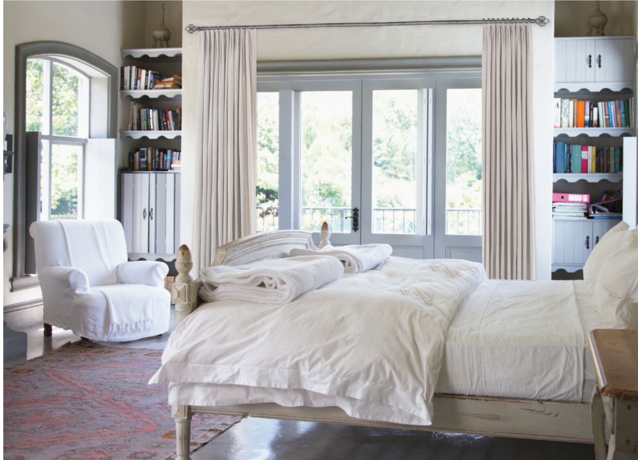
SWIVEL SOCKET Antique Pewter Shown