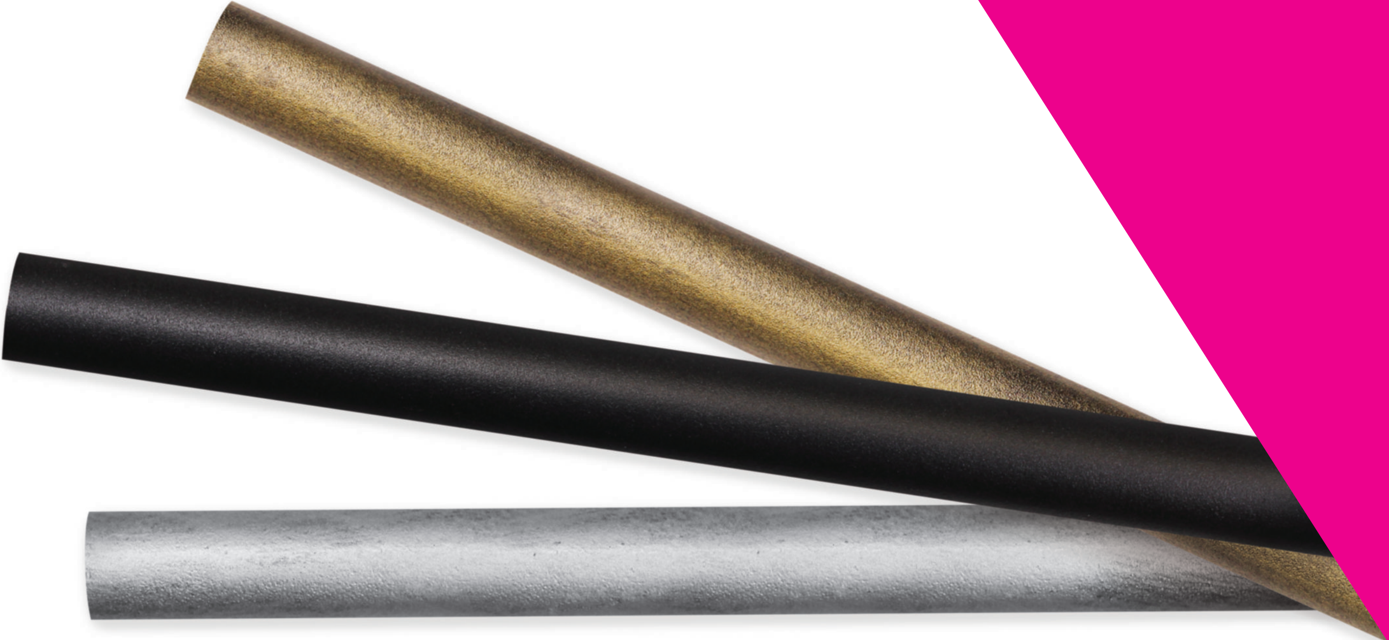
1" POLE Iron Gold, Black, Antique Pewter Shown.