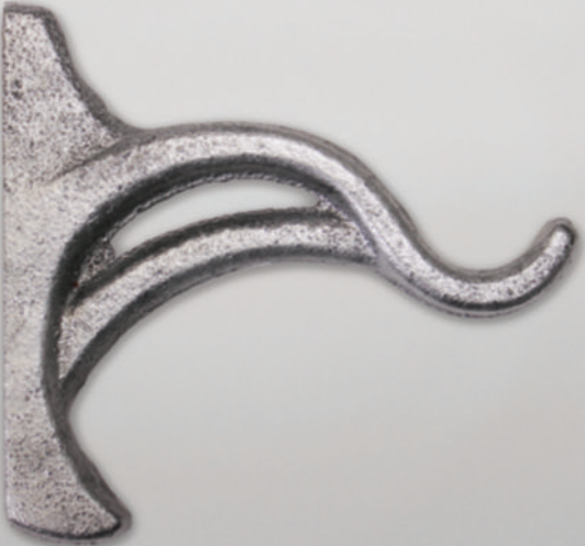
CENTER BYPASS BRACKET Antique Pewter Shown, 3½" Return.