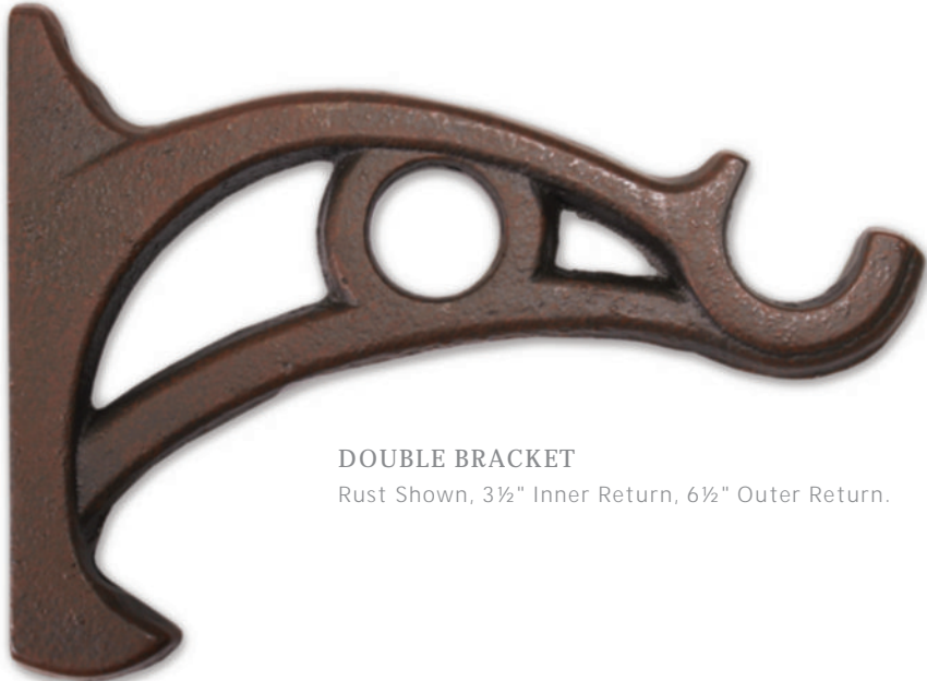
DOUBLE BRACKET Rust Shown, 3½" Inner Return, 6½" Outer Return.