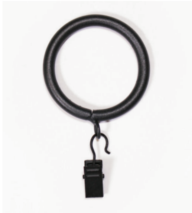
C-RINGS WITH CLIPS Iron Oxide Shown. Size 1".