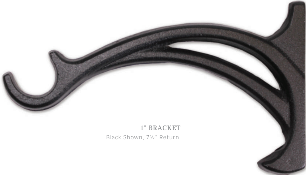
1" BRACKET Black Shown, 7½" Return.