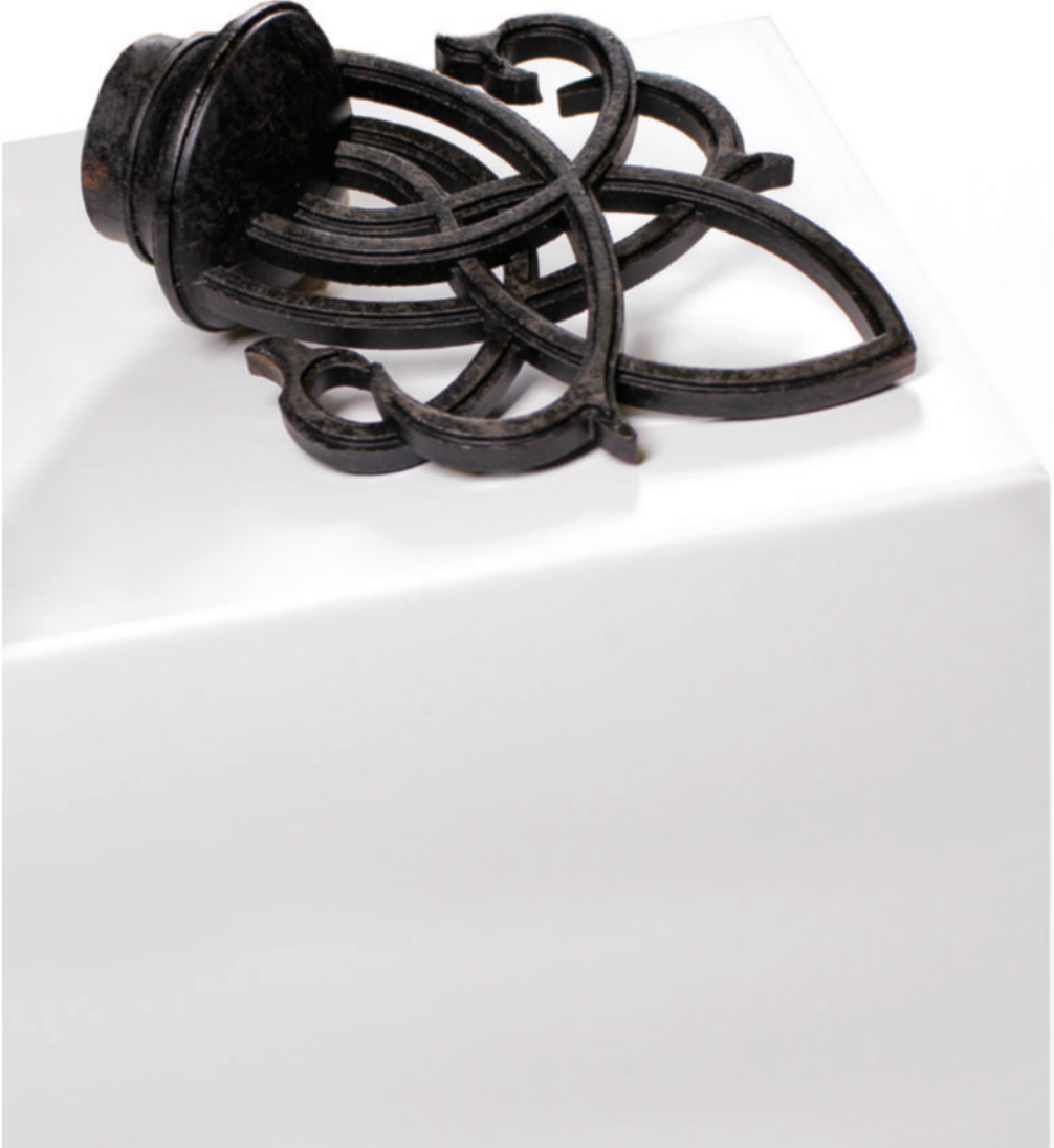
INNER LACE Iron Oxide Shown. Size 1".