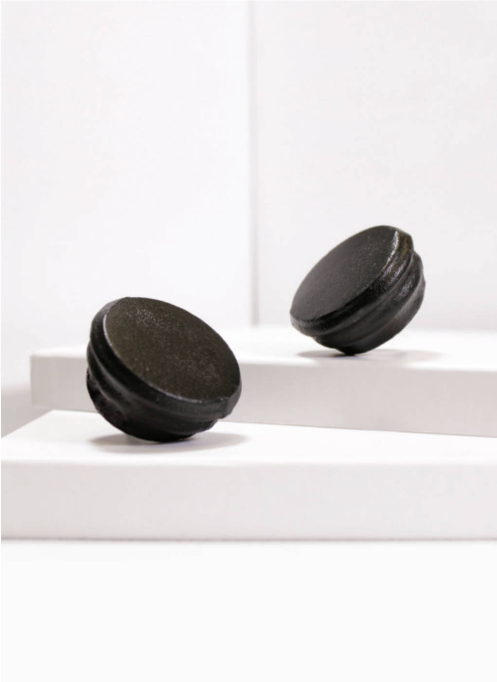
ENDCAP Black Shown. Size 1".