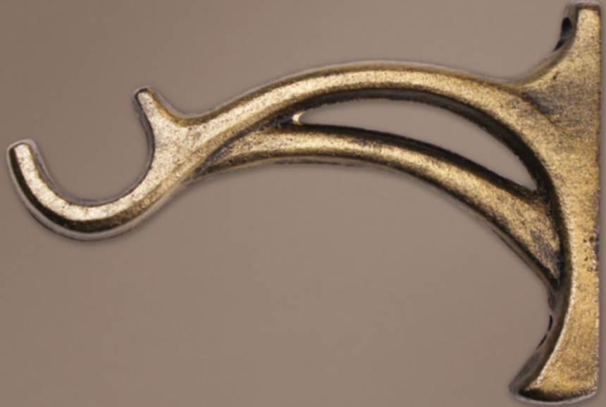
1" BRACKET Iron Gold Shown, 5½" Return.