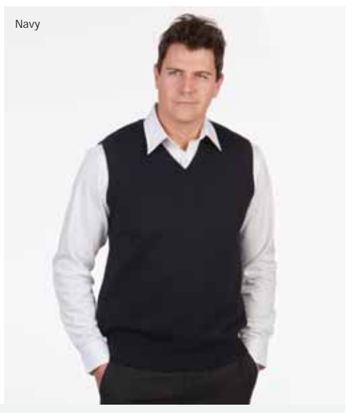
MF9002 Mens v-neck vest 100% Machine washable wool Size range: 10 – 30