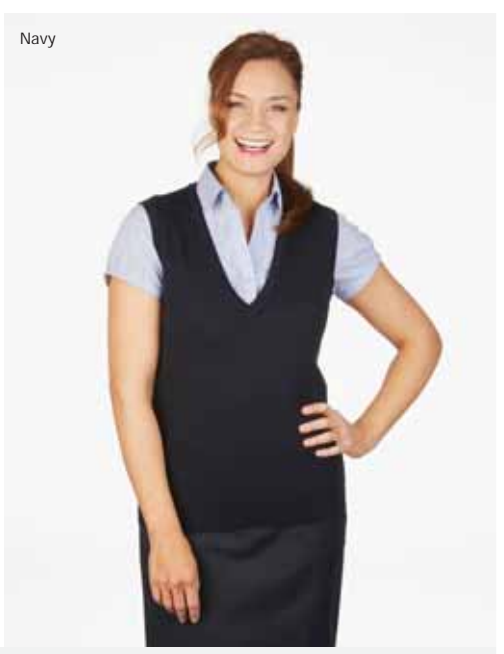
MF8010 Ladies extended v-neck vest with deep rib basque