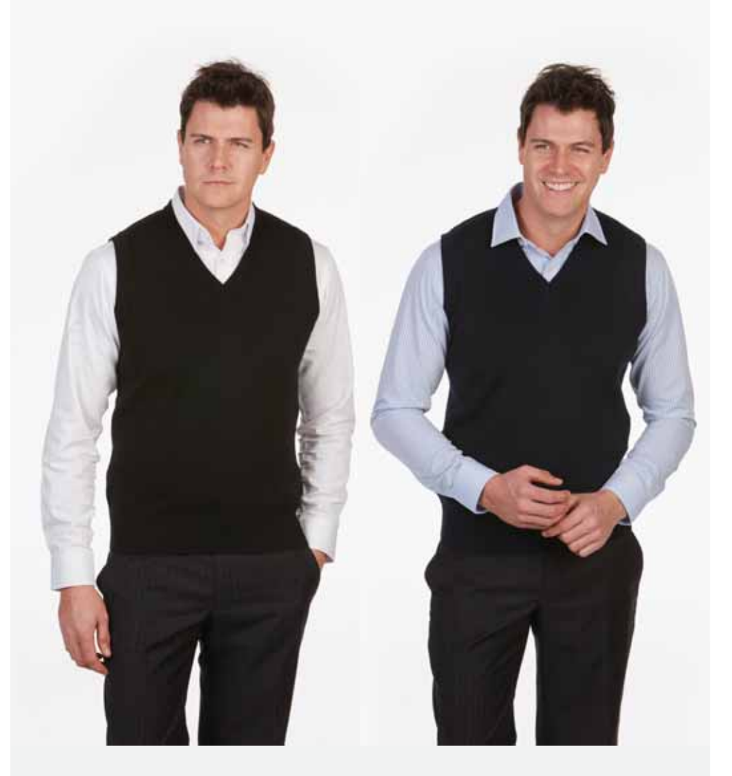
MF9004 Mens sleeveless v-neck vest 50% Australian Merino wool, 50% acrylic Machine washable

Size range: 10 – 30 Colour range: Black - Navy