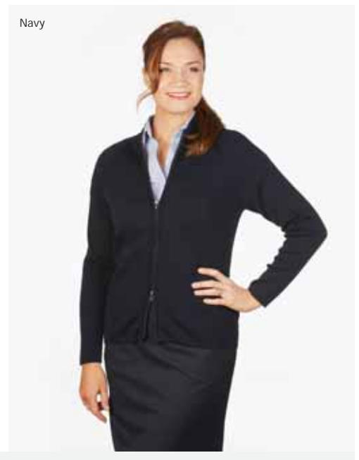
MF8012 Ladies long sleeve pointelle cardigan with two way zip

100% Machine washable wool Size range: XS – XXL