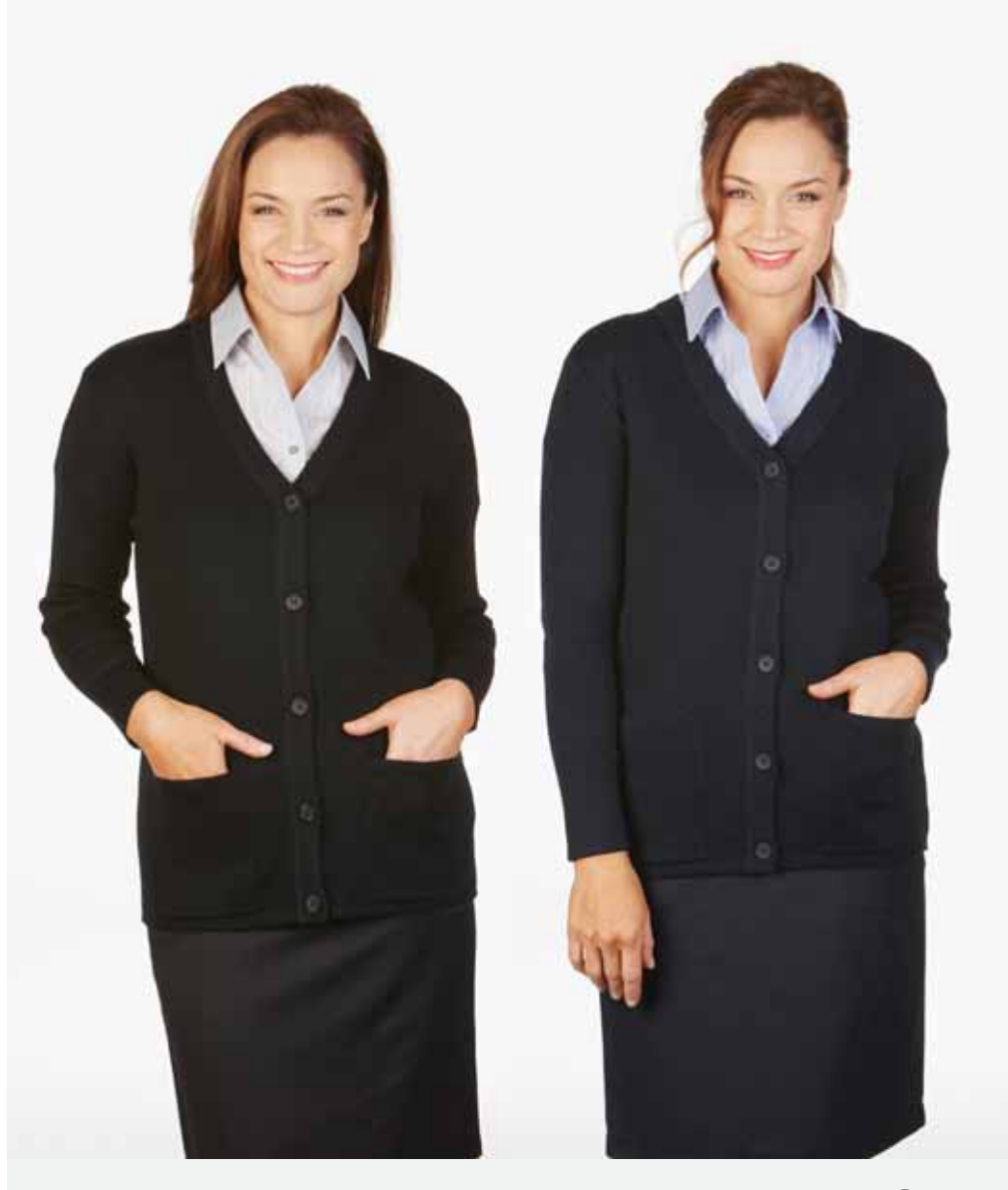
MF8005 Ladies long sleeve v-neck cardigan with pockets