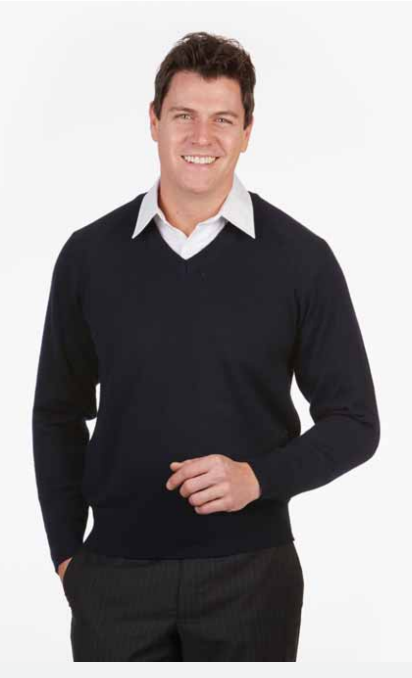
MF9001 Mens long sleeve v-neck pullover