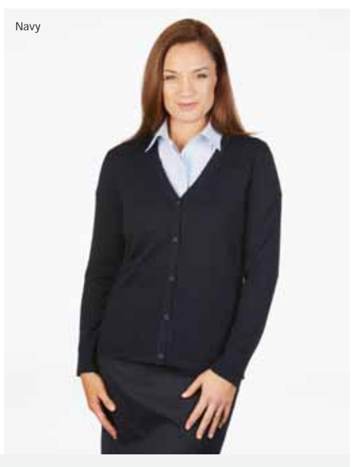
MF8003 Ladies long sleeve v-neck cardigan