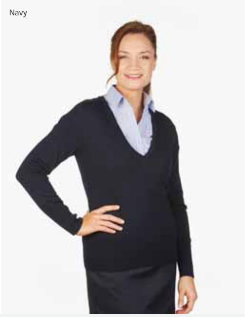
MF8011 Ladies extended v-neck pullover with deep rib basque