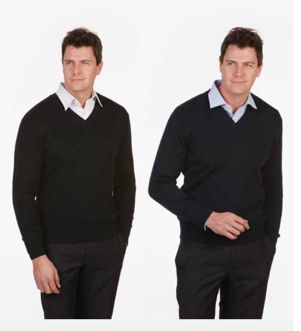
MF9003 Mens long sleeve v-neck pullover 50% Australian Merino wool, 50% acrylic Machine washable