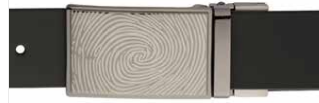
4820, 35MM, GUNMETAL BUCKLE