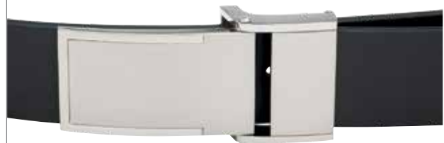
4098, 30MM, NICKEL BUCKLE