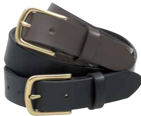
DROVER 30MM BK & BR FULL GRAIN BUFFALO LEATHER, BRASS BUCKLE 32"/82CM TO 62"/157CM RRP: AU$39.95 / NZ$49.95