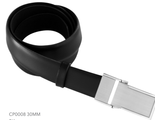
CP0008 30MM BK CLASSIC LEATHER, NICKEL BUCKLE 32"/82CM TO 62"/157CM