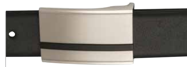
5945, 35MM, NICKEL BUCKLE