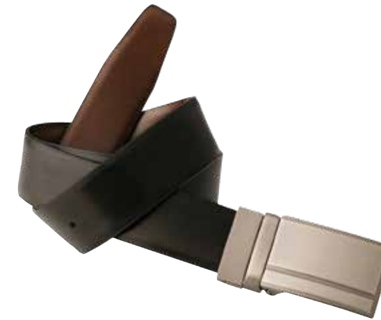
CEDAR 35MM BKBR (REVERSIBLE) SPANISH TEXAS LEATHER, GUNMETAL BUCKLE 32"/82CM TO 48"/122CM RRP: AU$59.95 / NZ$69.95

A SELECT RANGE OF PREMIUM BELTS WHICH ARE EITHER REVERSIBLE OR WITH LEATHER BACKINGS.