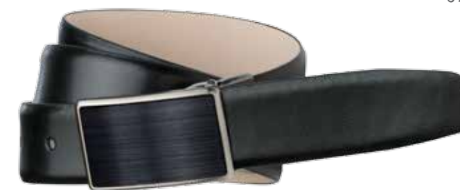
BRONTE 35MM BK & BR VENETIAN & NATURAL LEATHER, GUNMETAL BUCKLE 32"/82CM TO 62"/157CM RRP: AU$59 / NZ$79