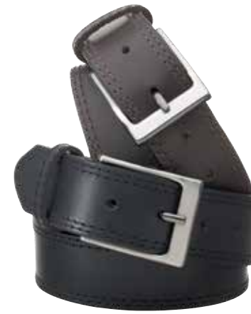
McALLISTER 35MM BK & BR FULL GRAIN BUFFALO LEATHER, NICKEL BUCKLE 32"/82CM TO 62"/157CM RRP: AU$49.95 / NZ$59.95