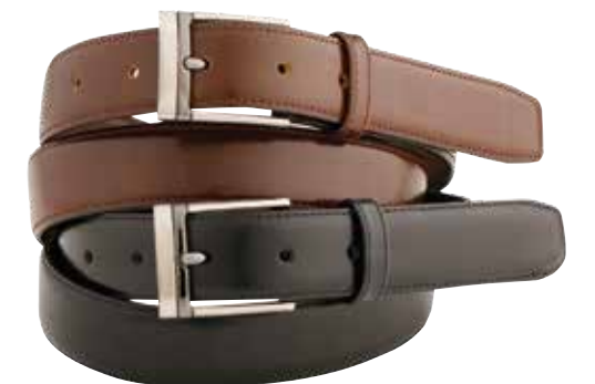
VINTAGE 30MM BK, BR, CHE & TN SPANISH TEXAS LEATHER, DARK NICKEL BUCKLE 32"/82CM TO 48"/122CM RRP: AU$39.95 / NZ$49.95