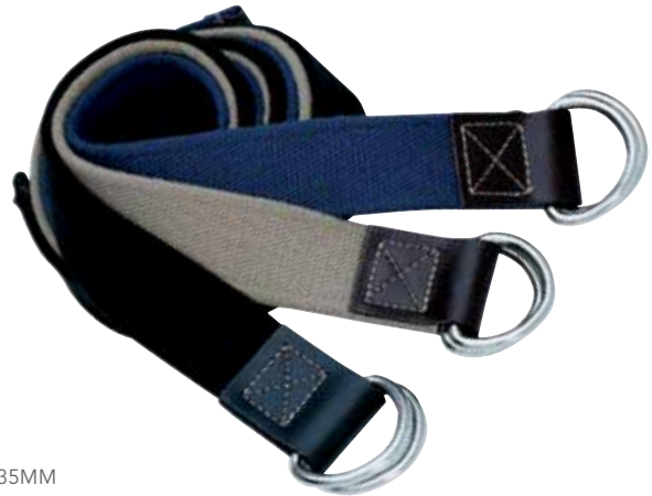
THOMAS 35MM COTTON, NICKEL BUCKLE S (34"), M (38"), L (42"), XL (46"), 2XL (50") RRP: AU$39.95 / NZ$49.95 REFER TO SWATCHES FOR COLOURS