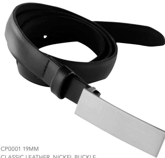
CP0001 19MM CLASSIC LEATHER, NICKEL BUCKLE 6 (26") TO 38 (58") OR 2XS (26") TO 7XL (48")

WE HAVE SERVICED CORPORATE AND UNIFORM SUPPLIERS FOR MORE THAN 30 YEARS AND CONTINUE TO PROVIDE CLEVER SOLUTIONS TO THIS MARKET.