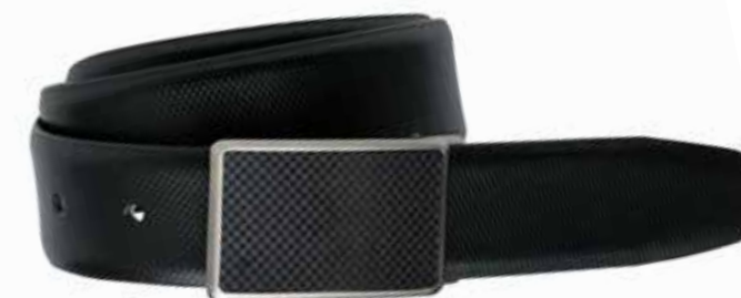
CARLTON 35MM BK & BR MADRID & NATURAL LEATHER, GUNMETAL BUCKLE 32"/82CM TO 62"/157CM RRP: AU$59 / NZ$79