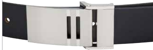
4081, 35MM, NICKEL BUCKLE