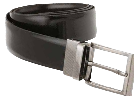
CAPITAL 35MM BKBR (REVERSIBLE) MARMOL LEATHER, GUNMETAL (LASER) BUCKLE 32"/82CM TO 48"/122CM RRP: AU$59 / NZ$79