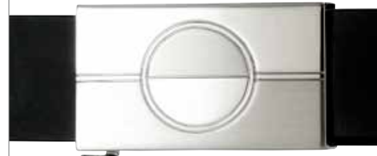
B2886, 35MM, GENUINE MILLED LEATHER NICKEL BUCKLE 32"/82CM TO 54"/137CM RRP: AU$59.95 / NZ$69.95