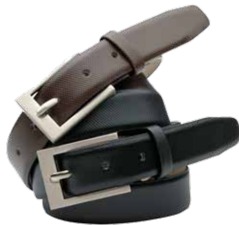
MINDIL 30MM BK & BR MADRID & NATURAL LEATHER, NICKEL BUCKLE 32"/82CM TO 48"/122CM RRP: AU$59 / NZ$79