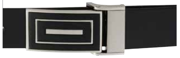
4284, 35MM, NICKEL BUCKLE