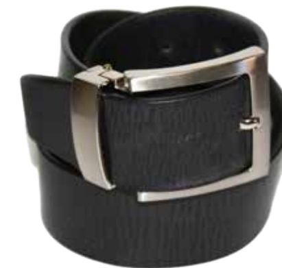
MOROCCO 38MM (SHOWN IN BLACK) BK, BR, EARTH & DESERT FULL GRAIN BUFFALO LEATHER, BRUSHED NICKEL BUCKLE 32"/82CM TO 54"/137CM RRP: AU$59 / NZ$79