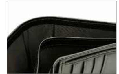
MWGENE BK & BR CARD WINDOW, 2 NOTE COMPARTMENTS & 5 CARD SLOTS RRP: AU$59.95 / NZ$69.95