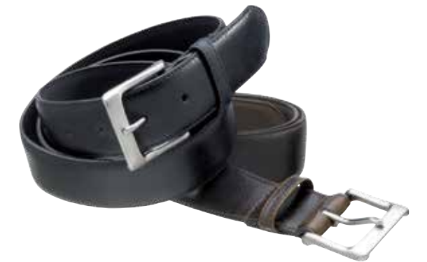
ROGUE 35MM BK, BR & BU OLD CLUB LEATHER, NICKEL BUCKLE 32"/82CM TO 62"/157CM RRP: AU$49.95 / NZ$59.95