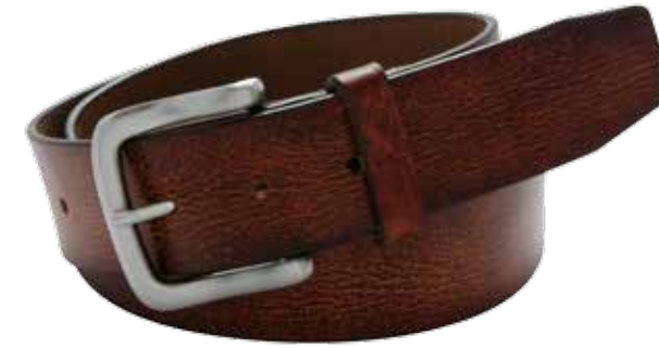
CAMEROON 38MM (SHOWN IN EARTH) BK, BR, EARTH & DESERT FULL GRAIN BUFFALO LEATHER, NICKEL BUCKLE 32"/82CM TO 52"/132CM RRP: AU$59 / NZ$79