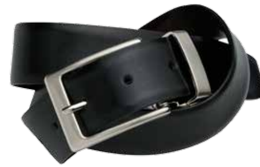
NIELSEN 35MM BKBR (REVERSIBLE) VENETIAN LEATHER, NICKEL BUCKLE 32"/82CM TO 62"/157CM RRP: AU$59 / NZ$79