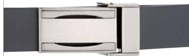
1080, 35MM, GUNMETAL BUCKLE