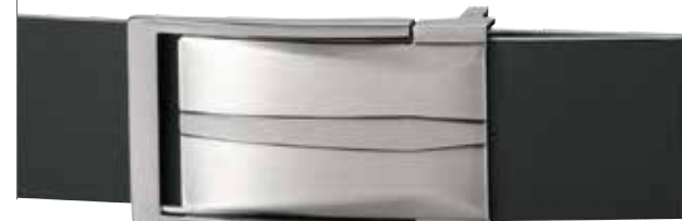
5043, 35MM, GUNMETAL BUCKLE