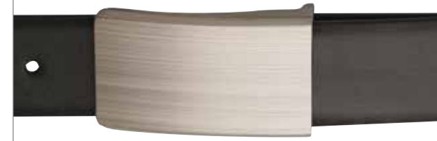
5992, 35MM, NICKEL BUCKLE