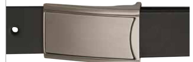
6799, 35MM, NICKEL BUCKLE