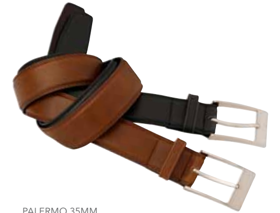
PALERMO 35MM BK & BR SUNDANCE LEATHER, NICKEL BUCKLE 32"/82CM TO 48"/122CM RRP: AU$49.95 / NZ$59.95