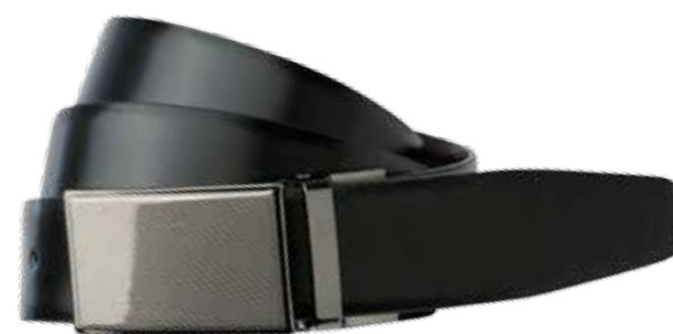
CLIFTON 35MM BKBR (REVERSIBLE) SPANISH TEXAS LEATHER, GUNMETAL BUCKLE 32"/82CM TO 48"/122CM RRP: AU$59 / NZ$79