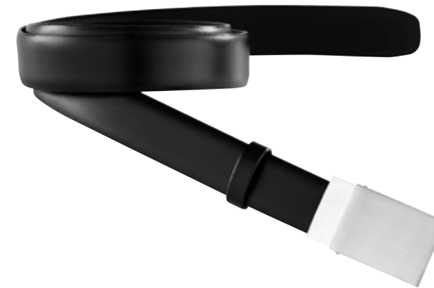
CP0006 30MM BK CLASSIC LEATHER, NICKEL BUCKLE 32"/82CM TO 62"/157CM