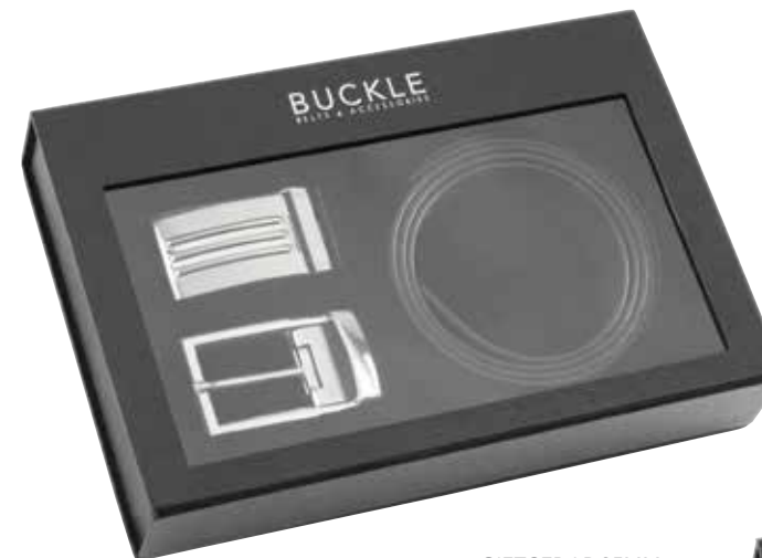
GIFTCEDAR 35MM BKBR (REVERSIBLE) DOUBLE BUCKLE GIFT PACK MAXIMUM LENGTH 44"/112CM RRP: AU$69.95 / NZ$79.95