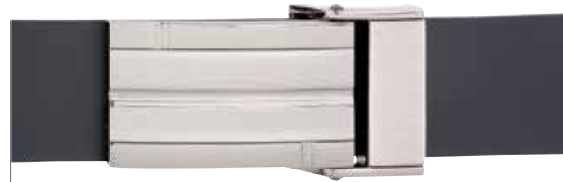
1079, 35MM, GUNMETAL BUCKLE