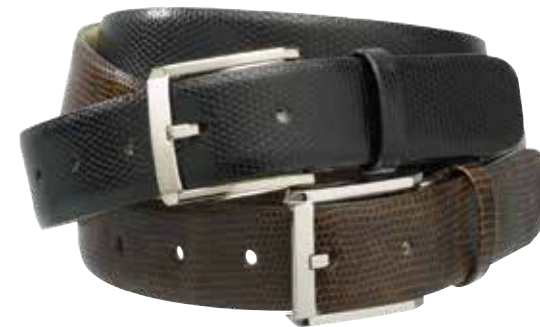
AMARILLO 30MM BK & BR IGUANA PRINT & NATURAL LEATHER, NICKEL BUCKLE 32"/82CM TO 46"/117CM RRP: AU$59.95 / NZ$69.95