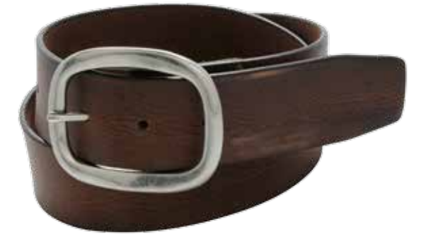
MARRAKESH 38MM (SHOWN IN BROWN) BK, BR, EARTH & DESERT FULL GRAIN BUFFALO LEATHER, RAW NICKEL BUCKLE 32"/82CM TO 52"/132CM RRP: AU$59 / NZ$79