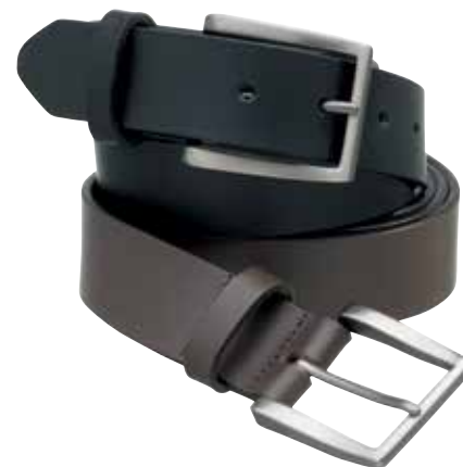
HALSTON 35MM BK & BR FULL GRAIN BUFFALO LEATHER, DARK NICKEL BUCKLE 32"/82CM TO 62"/157CM RRP: AU$49.95 / NZ$59.95