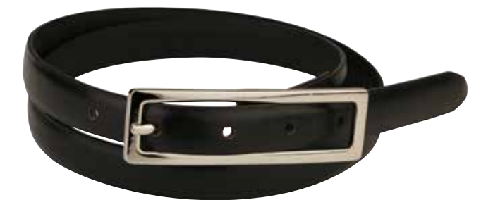
CP0016 19MM CLASSIC LEATHER, NICKEL BUCKLE 32"/82CM TO 62"/157CM