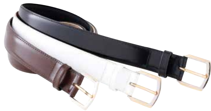
ELITE DELUXE 30MM BK, BR, NA & WH SPANISH TEXAS LEATHER, NICKEL & GOLD BUCKLE 32"/82CM TO 48"/122CM RRP: AU$34.95 / NZ$39.95