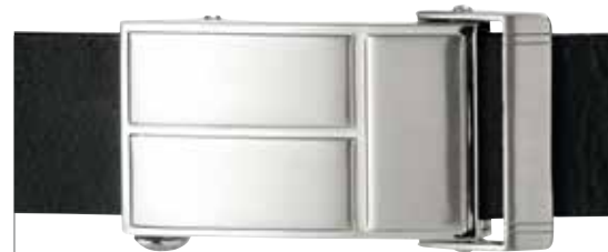
B2390, 35MM, GENUINE MILLED LEATHER NICKEL BUCKLE 32"/82CM TO 54"/137CM RRP: AU$59.95 / NZ$69.95