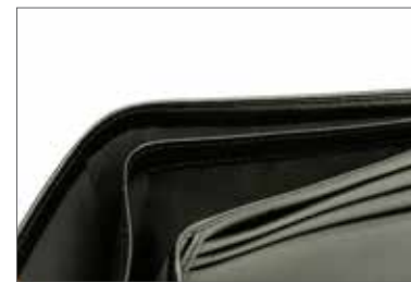
MWHUGO BK & BR CARD WINDOW, 2 NOTE COMPARTMENTS & 3 CARD SLOTS RRP: AU$59.95 / NZ$69.95