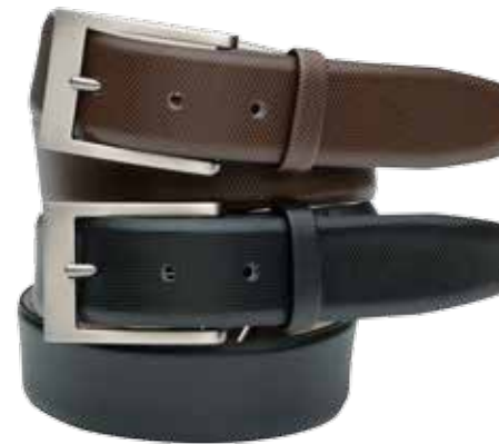
SANDY 35MM BK & BR MADRID & NATURAL LEATHER, NICKEL BUCKLE 32"/82CM TO 62"/157CM RRP: AU$59 / NZ$79