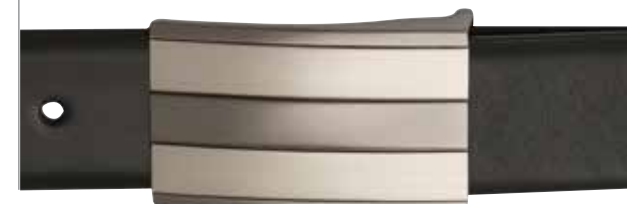
6934, 35MM, NICKEL BUCKLE