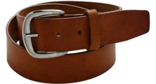
CHAD 38MM (SHOWN IN DESERT) BK, BR, EARTH & DESERT FULL GRAIN BUFFALO LEATHER, NICKEL BUCKLE 32"/82CM TO 52"/132CM RRP: AU$59 / NZ$79