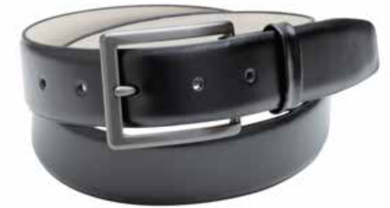
DONAL 35MM BK MARMOL & NATURAL LEATHER, DARK GUNMETAL BUCKLE 32"/82CM TO 48"/122CM RRP: AU$59.95 / NZ$69.95