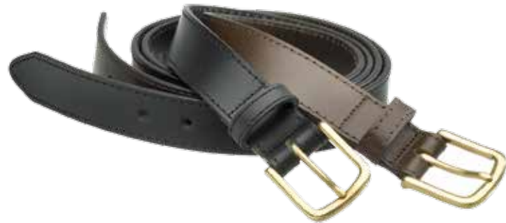
BOURKE 30MM BK & BR FULL GRAIN BUFFALO LEATHER, BRASS BUCKLE 32"/82CM TO 62"/157CM RRP: AU$39.95 / NZ$49.95