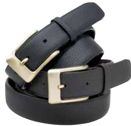
FINETTI 30MM BK & BR NAPPA LEATHER, GOLD BUCKLE 32"/82CM TO 62"/157CM RRP: AU$44.95 / NZ$54.95