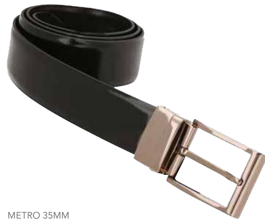
METRO 35MM BKBR (REVERSIBLE) MARMOL LEATHER, COFFEE GOLD (LASER) BUCKLE 32"/82CM TO 48"/122CM RRP: AU$59 / NZ$79