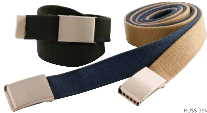
RUSS 35MM COTTON, PRESSED METAL BUCKLE S (34"), M (38"), L (42"), XL (46"), 2XL (50") RRP: AU$29.95 / NZ$34.95 REFER TO SWATCHES FOR COLOURS