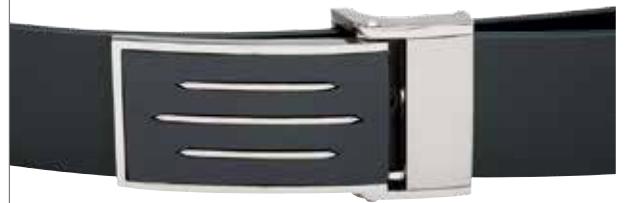
4281, 35MM, NICKEL BUCKLE