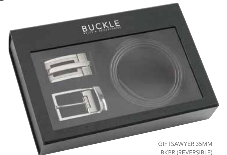
GIFTSAWYER 35MM BKBR (REVERSIBLE) DOUBLE BUCKLE GIFT PACK MAXIMUM LENGTH 44"/112CM RRP: AU$69.95 / NZ$79.95