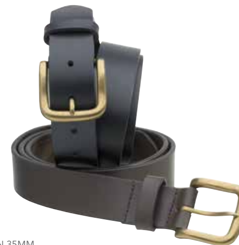
TRITON 35MM BK & BR FULL GRAIN BUFFALO LEATHER, BRASS BUCKLE 32"/82CM TO 62"/157CM RRP: AU$39.95 / NZ$49.95