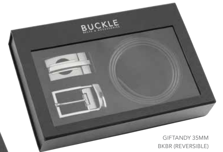
GIFTANDY 35MM BKBR (REVERSIBLE) DOUBLE BUCKLE GIFT PACK MAXIMUM LENGTH 44"/112CM RRP: AU$69.95 / NZ$79.95