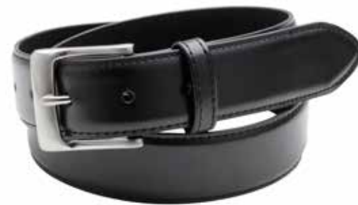
LAWSON 35MM BK, BR, TN & CHE CLASSIC & SPANISH TEXAS LEATHER, NICKEL BUCKLE 32"/82CM TO 70"/177CM RRP: AU$49.95 / NZ$59.95