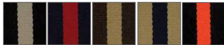
SBK SRD SBR SNT SOR