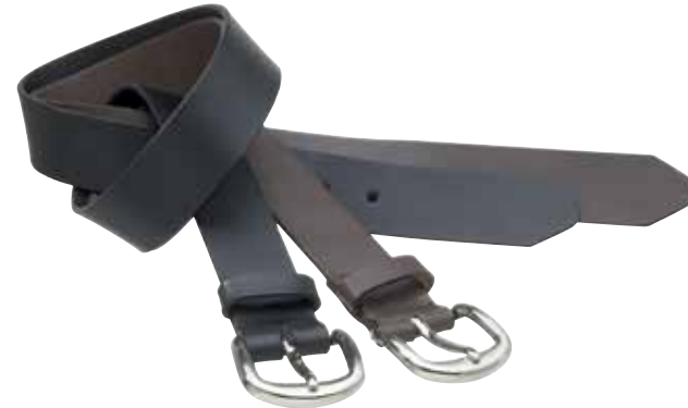
CASSIDY 38MM BK & BR FULL GRAIN BUFFALO LEATHER, NICKEL BUCKLE 32"/82CM TO 62"/157CM RRP: AU$49.95 / NZ$59.95