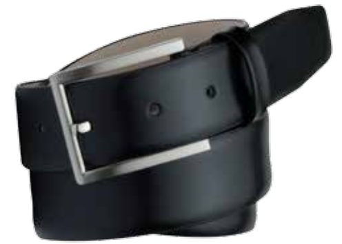
PORTSEA 35MM BK & BR VENETIAN & NATURAL LEATHER, NICKEL BUCKLE 32"/82CM TO 62"/157CM RRP: AU$59 / NZ$79