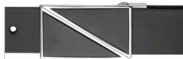
4377, 35MM, NICKEL BUCKLE