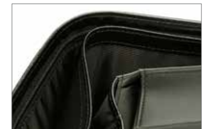
MWOSCAR BK & BR CARD WINDOW, 2 NOTE COMPARTMENTS & COIN PURSE WITH ZIPPER RRP: AU$59.95 / NZ$69.95