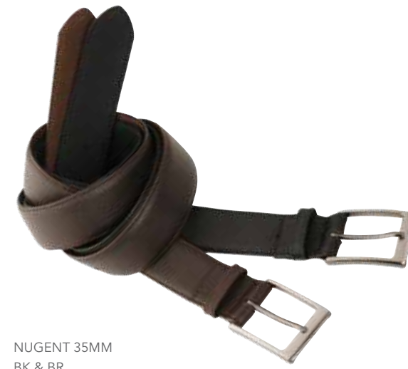
NUGENT 35MM BK & BR NAPPA LEATHER, NICKEL BUCKLE 32"/82CM TO 62"/157CM RRP: AU$49.95 / NZ$59.95