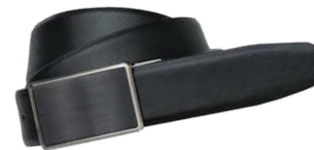
COOGEE 35MM BK & BR MONTANA & NATURAL LEATHER, GUNMETAL BUCKLE 32"/82CM TO 62"/157CM RRP: AU$59 / NZ$79