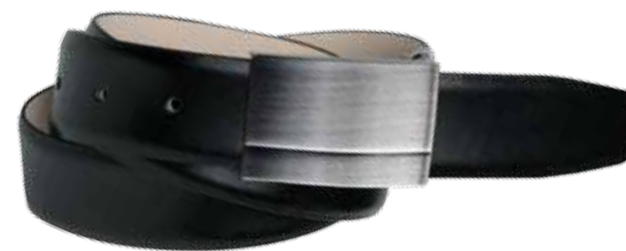
BRIGHTON 35MM BK & BR VENETIAN & NATURAL LEATHER, GUNMETAL BUCKLE 32"/82CM TO 62"/157CM RRP: AU$59 / NZ$79