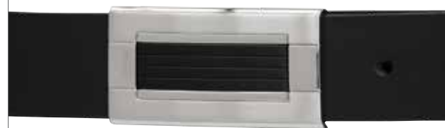
1819, 35MM, NICKEL BUCKLE