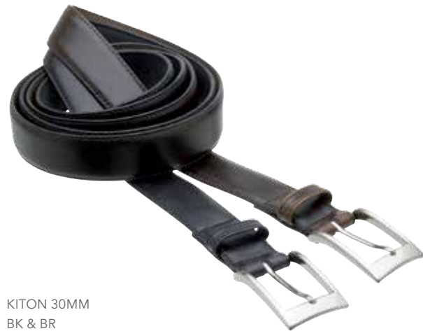
KITON 30MM BK & BR OLD CLUB LEATHER, NICKEL BUCKLE 32"/82CM TO 48"/122CM RRP: AU$39.95 / NZ$49.95