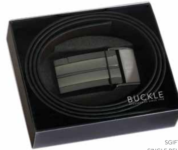
SGIFT5043 35MM SINGLE BELT GIFT PACK BKBR (REVERSIBLE) SPANISH TEXAS LEATHER MAXIMUM LENGTH 44"/112CM RRP: AU$59.95 / NZ$69.95

LIKE THE IDEA OF A SINGLE BELT GIFT BACK, BUT WANT TO CHOOSE YOUR OWN BUCKLE? SIMPLY MAKE A SELECTION FROM THE SMART CASUAL RANGE AND ADD 'SGIFT' TO THE FRONT OF THE FOUR DIGIT BUCKLE CODE.