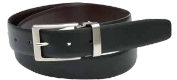
SEAFORD 35MM BKBR (REVERSIBLE) MONTANA LEATHER, NICKEL BUCKLE 32"/82CM TO 48"/122CM RRP: AU$59 / NZ$79