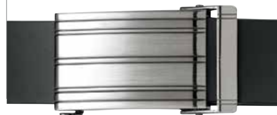
B2896, 35MM, GENUINE MILLED LEATHER GUNMETAL BUCKLE 32"/82CM TO 54"/137CM RRP: AU$59.95 / NZ$69.95