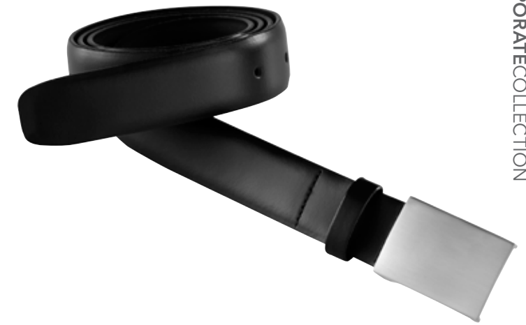
CP0007 30MM BK CLASSIC LEATHER, NICKEL BUCKLE 32"/82CM TO 62"/157CM