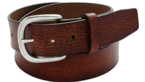
SUDAN 38MM (SHOWN IN EARTH) BK, BR, EARTH & DESERT FULL GRAIN BUFFALO LEATHER, SATIN NICKEL BUCKLE 32"/82CM TO 52"/132CM RRP: AU$59 / NZ$79