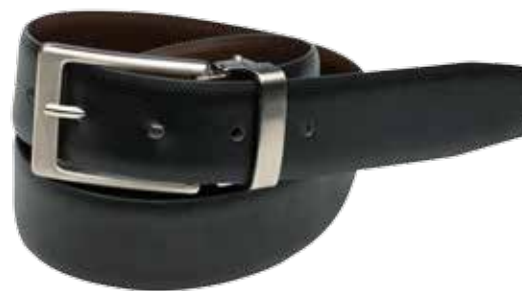
TWEED 35MM BKBR (REVERSIBLE) MADRID LEATHER, NICKEL BUCKLE 32"/82CM TO 48"/122CM RRP: AU$59 / NZ$79