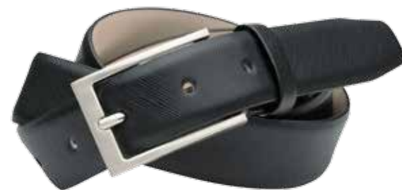
MISSION 30MM BK & BR MONTANA & NATURAL LEATHER, NICKEL BUCKLE 32"/82CM TO 48"/122CM RRP: AU$59 / NZ$79