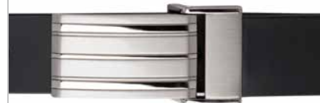
4394, 35MM, NICKEL BUCKLE