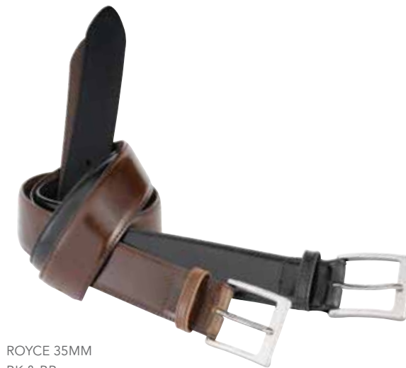
ROYCE 35MM BK & BR MARMOL LEATHER, NICKEL BUCKLE 32"/82CM TO 48"/122CM RRP: AU$49.95 / NZ$59.95