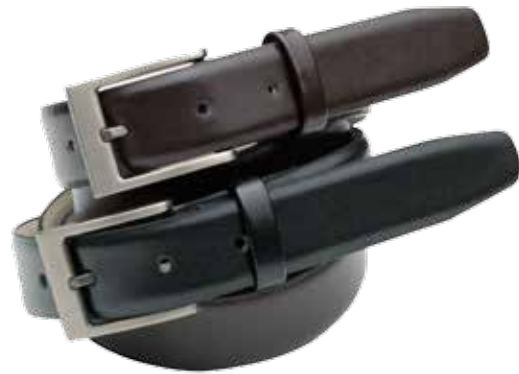
LORNE 30MM BK & BR VENETIAN & NATURAL LEATHER, DARK NICKEL BUCKLE 32"/82CM TO 62"/157CM RRP: AU$59 / NZ$79