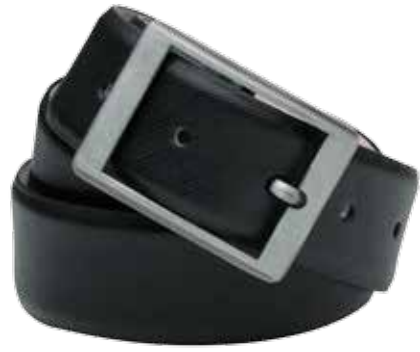
FINGAL 35MM BK & BR MONTANA & NATURAL LEATHER, GUNMETAL BUCKLE 32"/82CM TO 62"/157CM RRP: AU$59 / NZ$79