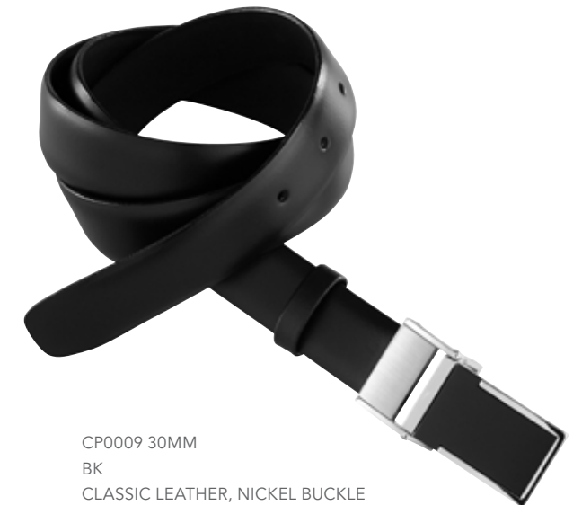
CP0009 30MM BK CLASSIC LEATHER, NICKEL BUCKLE 32"/82CM TO 62"/157CM