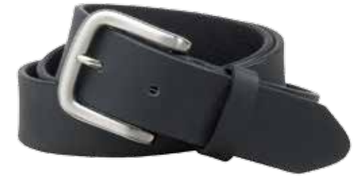
MERINO 35MM BK FULL GRAIN MILLED LEATHER, NICKEL BUCKLE 32"/82CM TO 52"/132CM RRP: AU$39.95 / NZ$49.95