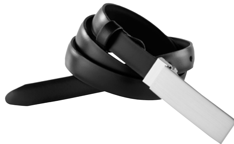
CP0002 19MM CLASSIC LEATHER, NICKEL BUCKLE 6 (26") TO 38 (58") OR 2XS (26") TO 7XL (48")