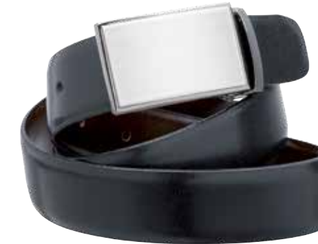
DURBAN 30MM BKBR (REVERSIBLE) SPANISH TEXAS LEATHER, GUNMETAL BUCKLE 32"/82CM TO 48"/122CM RRP: AU$59.95 / NZ$69.95