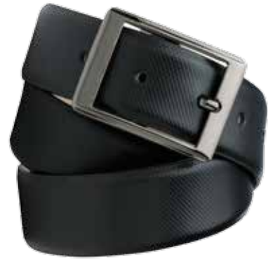
GLENELG 35MM BK & BR MADRID & NATURAL LEATHER, GUNMETAL BUCKLE 32"/82CM TO 62"/157CM RRP: AU$59 / NZ$79