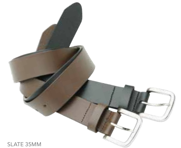
SLATE 35MM BK & BR FULL GRAIN BUFFALO LEATHER, NICKEL BUCKLE 32"/82CM TO 62"/157CM RRP: AU$39.95 / NZ$49.95