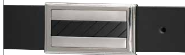
1821, 35MM, NICKEL BUCKLE