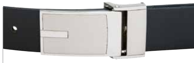
4077, 35MM, NICKEL BUCKLE