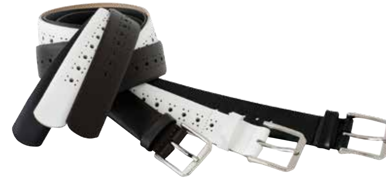
PORTHOLE 30MM BK, BR & WH CLASSIC LEATHER, NICKEL BUCKLE 32"/82CM TO 48"/122CM RRP: AU$34.95 / NZ$39.95