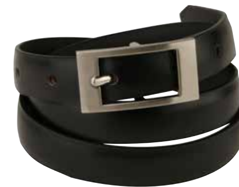
CP0015 19MM CLASSIC LEATHER, NICKEL BUCKLE 32"/82CM TO 62"/157CM