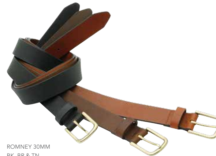
ROMNEY 30MM BK, BR & TN FULL GRAIN MILLED LEATHER, BRASS BUCKLE 32"/82CM TO 44"/112CM RRP: AU$39.95 / NZ$49.95