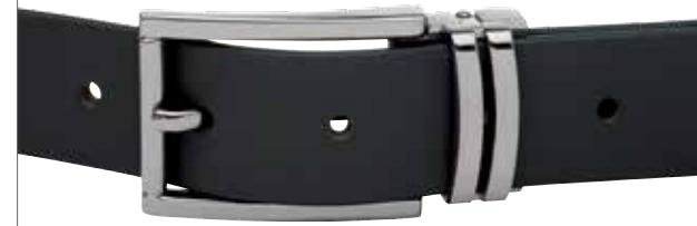
4527, 30MM, GUNMETAL BUCKLE