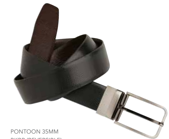
PONTOON 35MM BKBR (REVERSIBLE) IGUANA PRINT LEATHER, GUNMETAL BUCKLE 32"/82CM TO 48"/122CM RRP: AU$59.95 / NZ$69.95