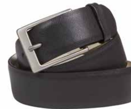
LUCCA 35MM BK, BR & GY MONTANA & NATURAL LEATHER, DARK NICKEL BUCKLE 32"/82CM TO 62"/157CM RRP: AU$79.00 / NZ$99.00