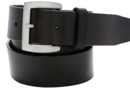
KENYA 38MM (SHOWN IN BLACK) BK, BR, EARTH & DESERT FULL GRAIN BUFFALO LEATHER, NICKEL BUCKLE 32"/82CM TO 52"/132CM RRP: AU$59 / NZ$79