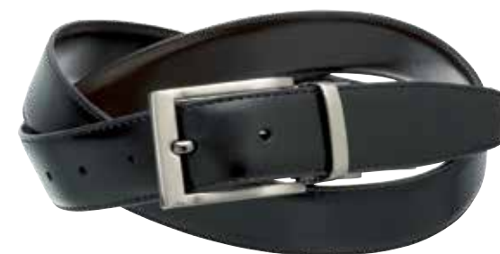
BANYAN 30MM BKBR (REVERSIBLE) SPANISH TEXAS LEATHER, GUNMETAL BUCKLE 32"/82CM TO 48"/122CM RRP: AU$49.95 / NZ$59.95