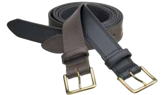
WYOMING 35MM BK & BR FULL GRAIN BUFFALO LEATHER, BRASS BUCKLE 32"/82CM TO 70"/177CM RRP: AU$49.95 / NZ$59.95