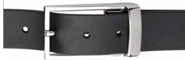
2087, 35MM, NICKEL BUCKLE