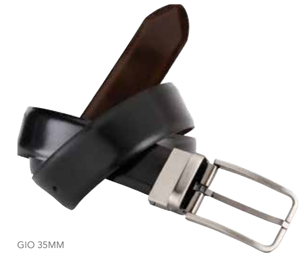
GIO 35MM BKBR (REVERSIBLE) MARMOL LEATHER, GUNMETAL BUCKLE 32"/82CM TO 48"/122CM RRP: AU$59.95 / NZ$69.95