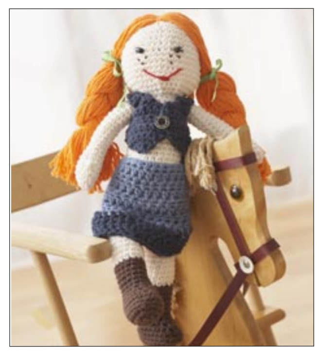
DENIM DOLL (TO CROCHET) LILY® SUGAR N' CREAM