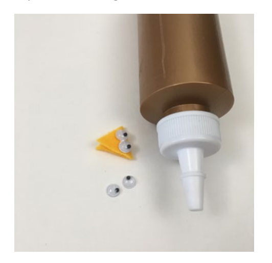
Step 6: Separate pompom yarn to create space for beak. Apply glue in the space. Press beak/eyes into glue.