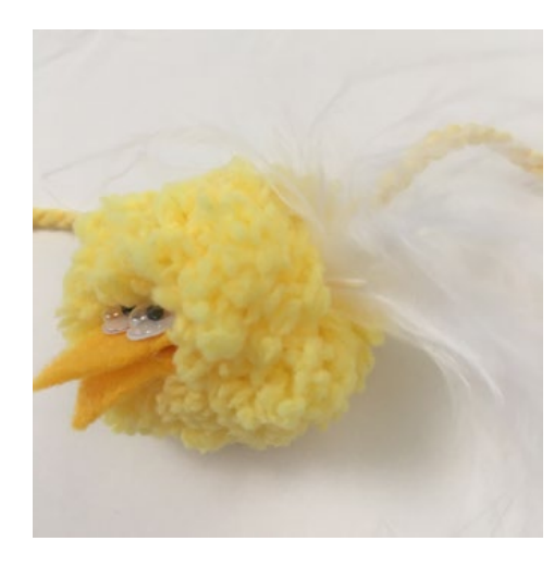
Step 10: Repeat Steps 1-9 to glue beaks and feathers on remaining pompoms.