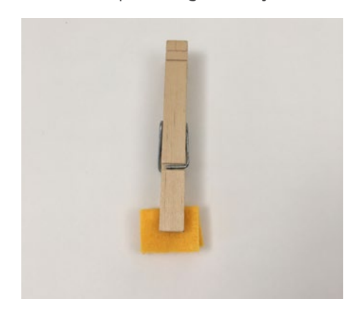
Step 4: Cut a "V" in felt to create triangle for beak.