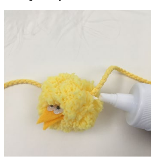
Step 8: Cut two 1/4" [6mm] sections of feather for each chick's wings.