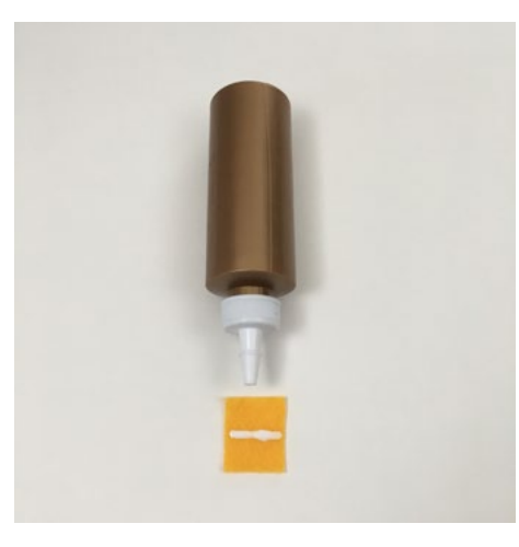
Step 3: Fold rectangle in half and hold closed with clothespin until glue is dry.