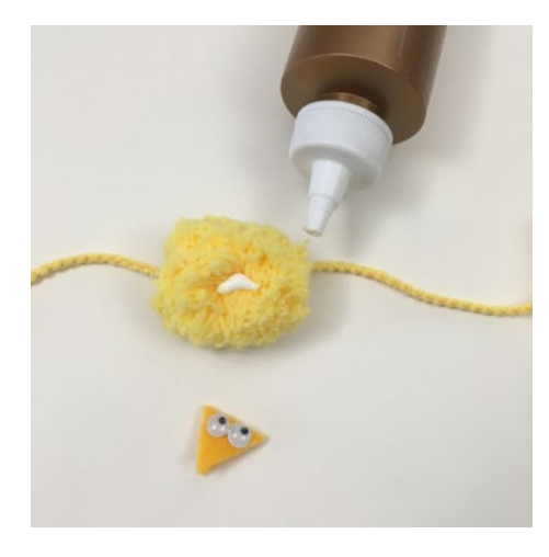
Step 7: Apply glue to either side of pompom where garland yarn connects.