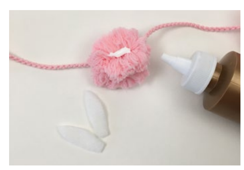
Step 3: Press base of ears into glue to secure.

Step 2: Pull pompom yarn apart to create space for ears. Apply glue in the space.