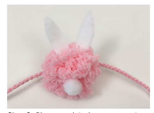
Step 6: Glue completed pompom onto skewer.