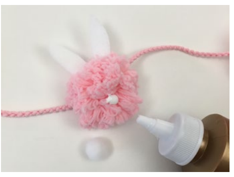
Step 5: Press small white pompom into glue to adhere and allow to dry.