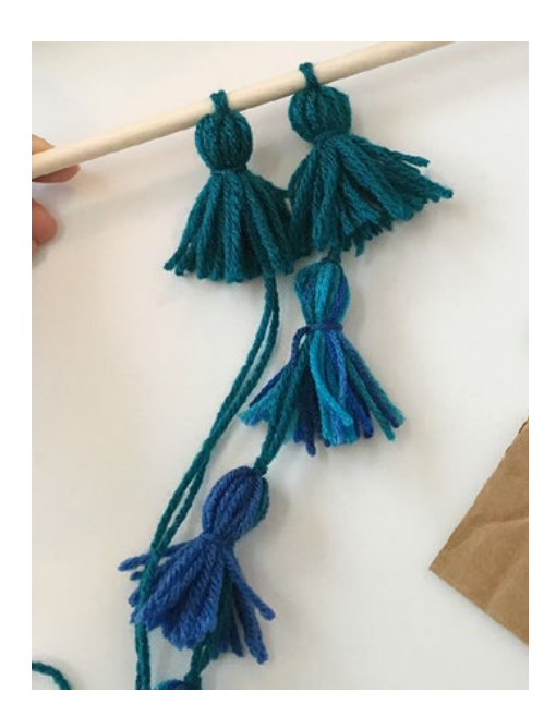
Tassels 2-4 Continue with Column 2 by repeating Tassels 2-4 of Column 1.