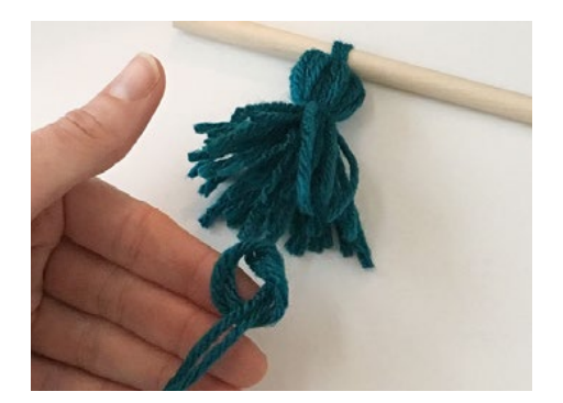
Step 8: Knot base yarn slightly beneath tassel just made.