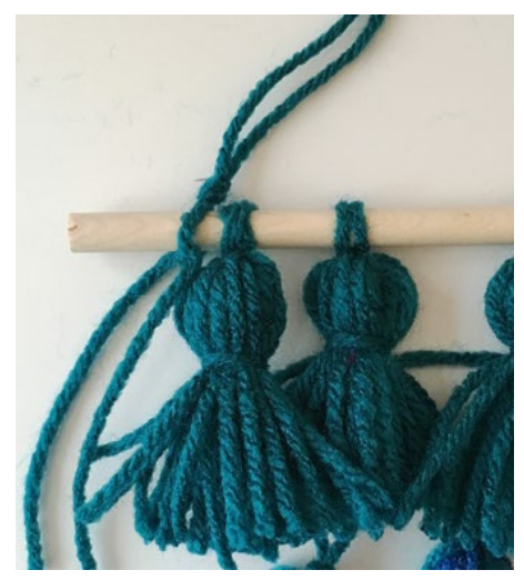
then knot twice between dowel and top of head same tassel.

*Tie tails of first knot around end of dowel close to Tassel of Column 4,