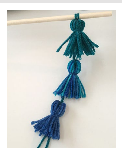
Tassel 4 Repeat Tassel 2.