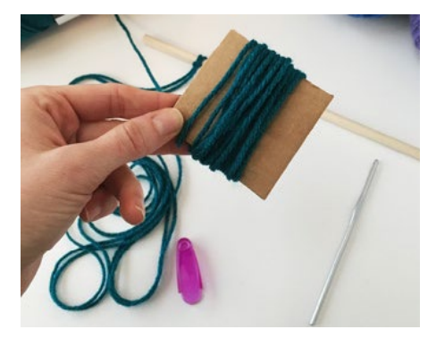
Step 3: Cut wraps at one end of cardboard and, keeping strands folded, remove cardboard.

Step 2: Wrap strand of A 20 times around cardboard.