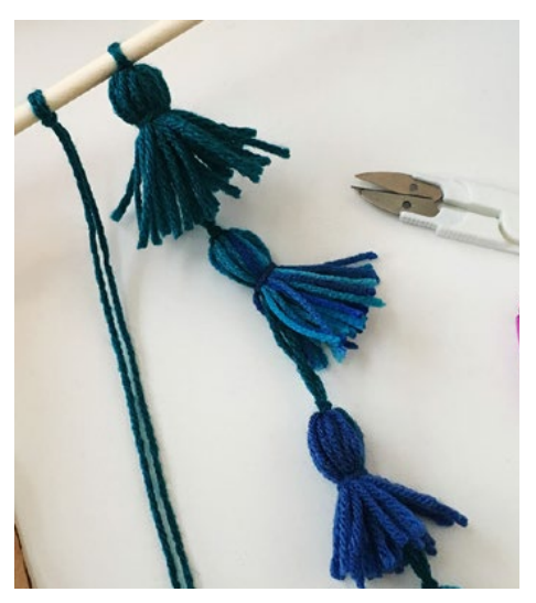
Repeat Steps 2–8.