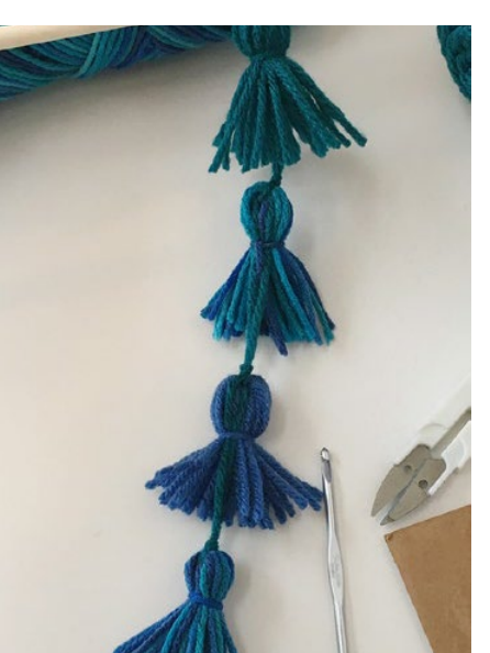
Tassel 5 With D, repeat Steps 2–8. Trim excess base yarn and slide