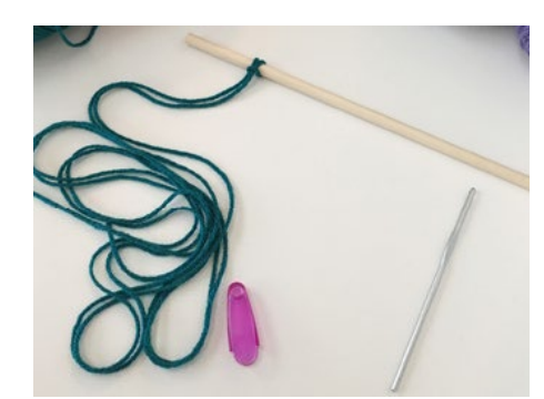
Fold in half evenly and tie tightly on dowel.

Step 1 (base yarn): Cut 40" (101.5 cm) length of A.