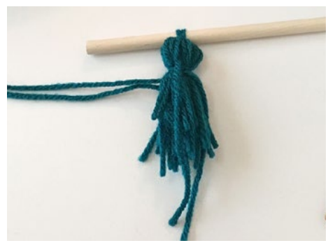
Step 6: Hold base yarn away from tassel and trim tassel ends evenly.