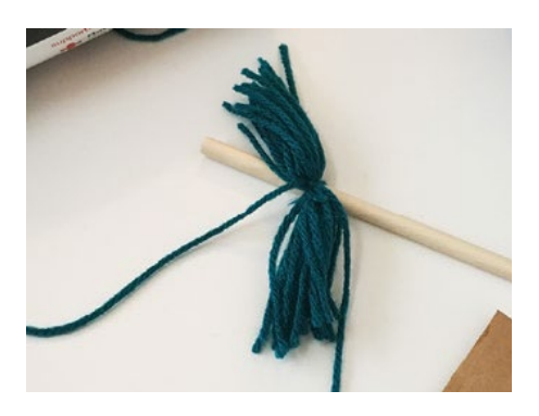
and tie a knot under wraps.