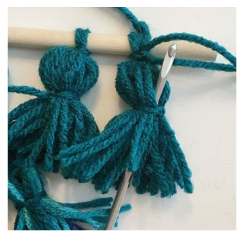
With tails of 2nd knot, repeat from * on other end of dowel near Column 8.