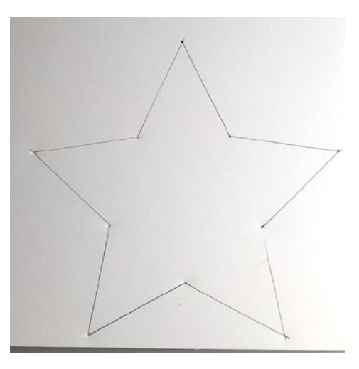
Step 3: Carefully cut out star with utility knife.

Step 2: With pencil and ruler, connect marked outer points and inner corners to draw the star.