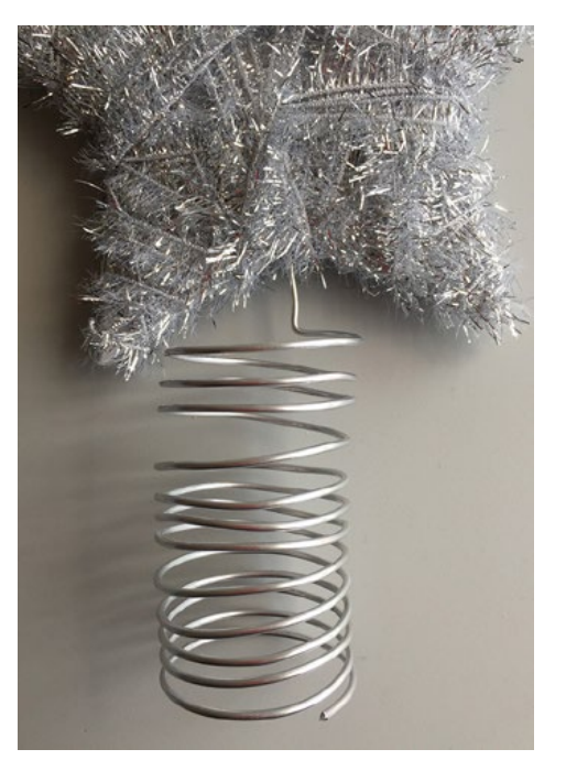
See next page for template and alternate photo

Step 7: Push straight end of coil between yarn wraps into an inner corner.