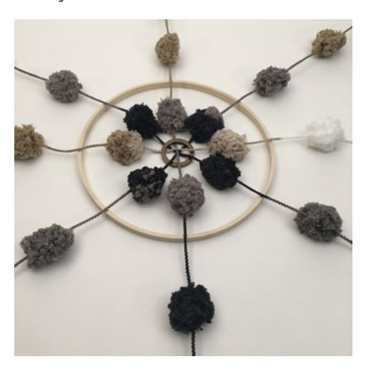
Step 3: Place outer ring of hoop over inner ring.

Step 2: Place inner ring of first hoop on work surface. Keep strands evenly spaced around metal ring; place metal ring inside hoop and lay out strands evenly.