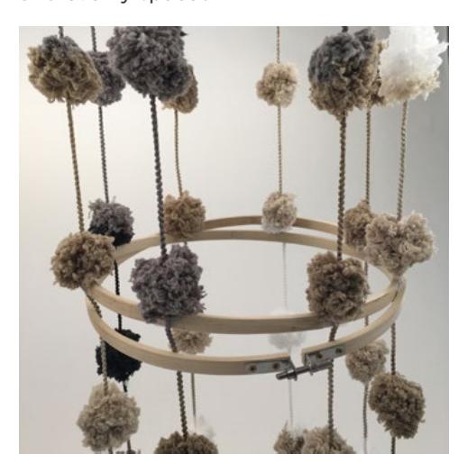
Step 9: Tighten tension screw as needed to secure.