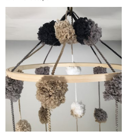
Step 7: Place 2nd inner hoop inside hanging strands, below 4th pompom of each strand. Tape each strand of yarn below pompom to hoop to hold in place.