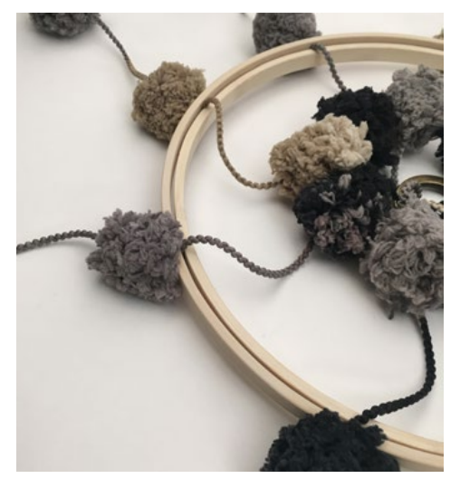
Step 5: Push outer ring onto inner ring and tighten tension screw as needed to secure strands between rings.