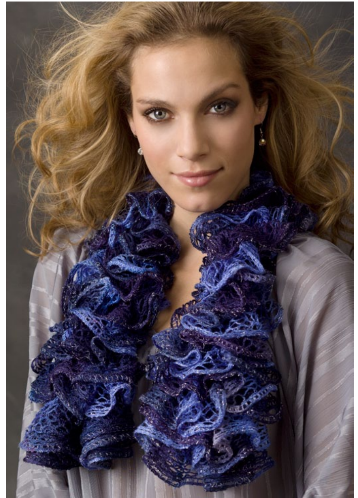
Shorter scarf shown in 1934 Rumba.