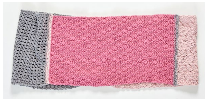
Section 1: Seeded Rib