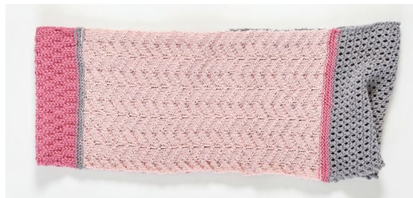
Section 2: Chevron