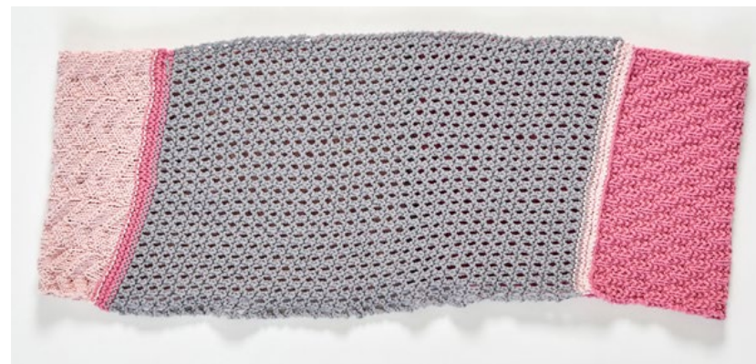
Section 3: Eyelet Ridges