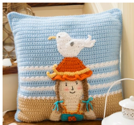
From left to right: Snowy Day Pillow Falling Leaves pillow and By the Sea Pillow