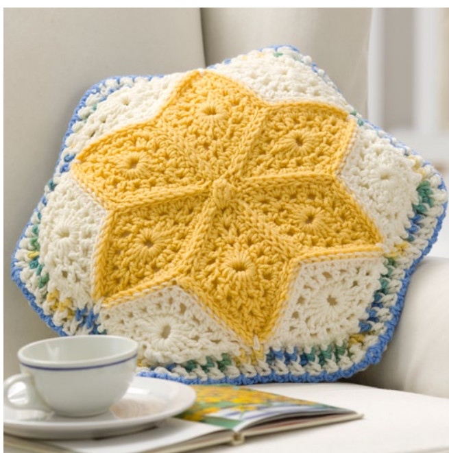
Alaska Snow Flowers Pillow