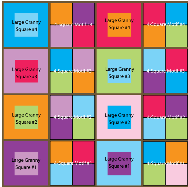
Strip 1 Strip 2 Strip 3 Strip 4