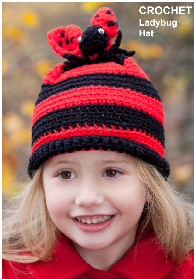
CROCHET Ladybug Hat