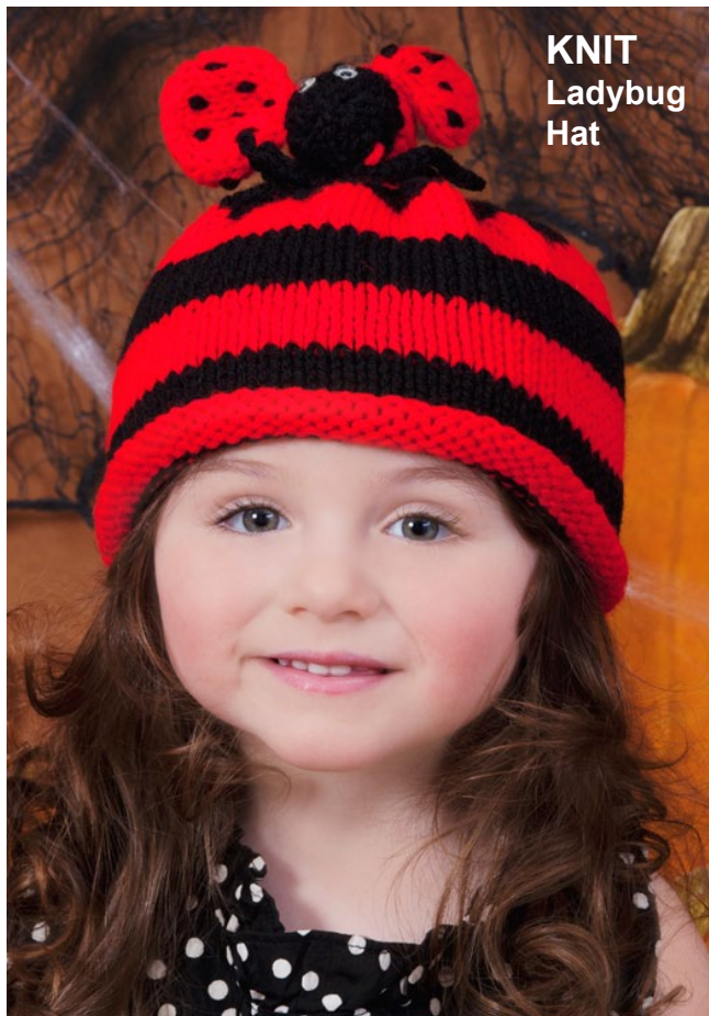
KNIT Ladybug Hat

Sew body seam, filling body with fiberfill. With yarn needle and B , embroider a line of chain stitches down back of body and French knot spots on wings. Sew legs across bottom of body so that they evenly extend on each side. Sew wings to back of body. Glue Wiggle Eyes. Sew Ladybug to center top of hat. Weave in ends.