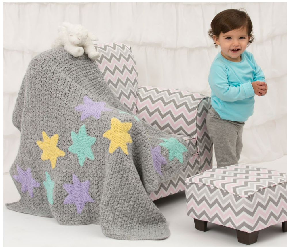
half double crochet