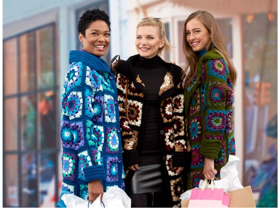
See LW5299 and W5303 for coats in alternate colorways.

See next page Stitch Diagram and alternate photo