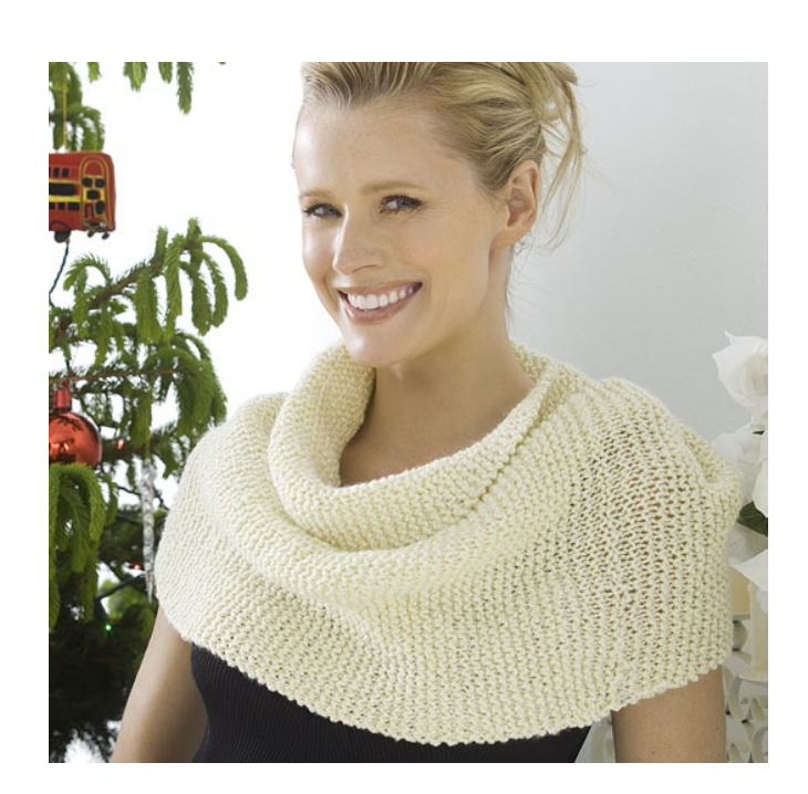
KNIT MOBIUS WRAP

Pull over head with twist at front and adjust top to cover shoulders as desired OR , pull down to waist with seam at center back, then pull the front of circle up over your head. Adjust piece to fit and fold back collar.