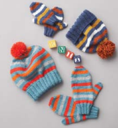
Contrast Band Version