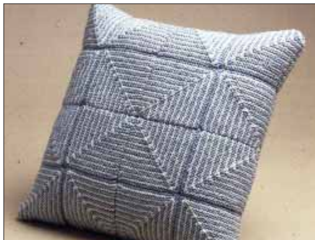
Large Pastel Squares Pillow (to knit)