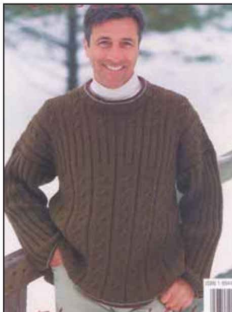
RIBS & CABLES (FOR MEN)