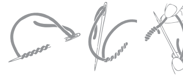
Bullion Stitch Diagram