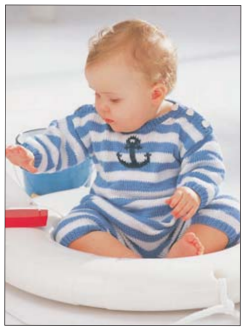
Anchors Away Romper (to knit)