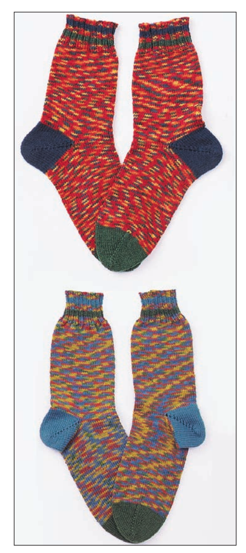
PATONS® KROY SOCKS UPSIDEDOWNERS (TOE-UPS)