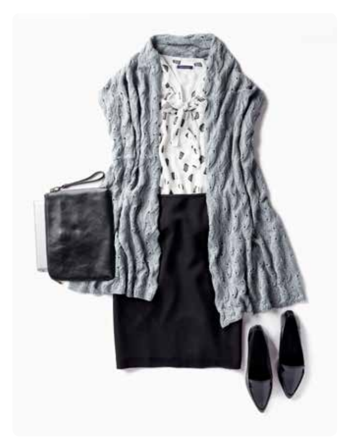
Style 1 Style 2