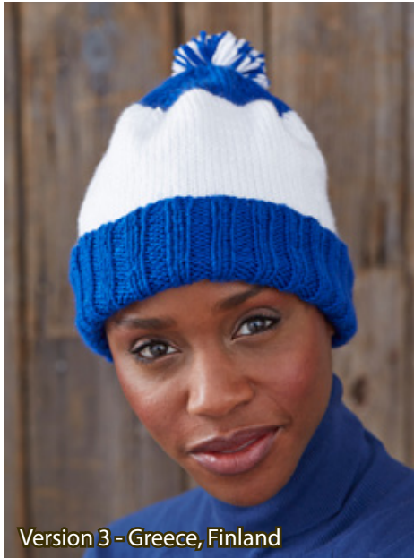
Version 3 - Greece, Finland