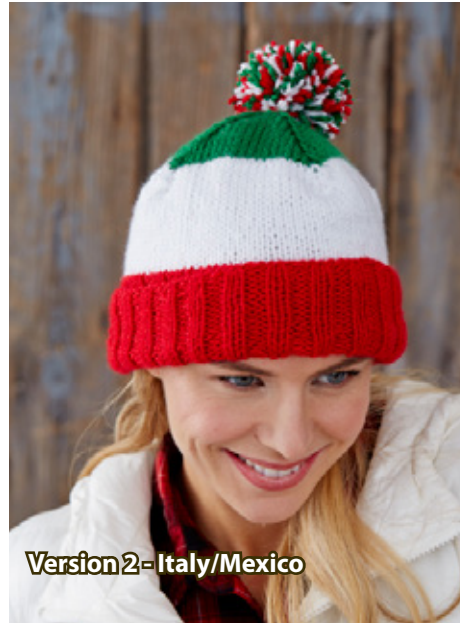
Version 2 - Italy/Mexico