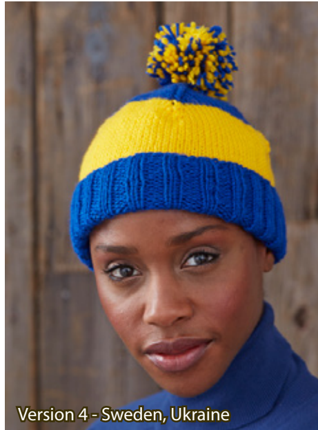
Version 4 - Sweden, Ukraine