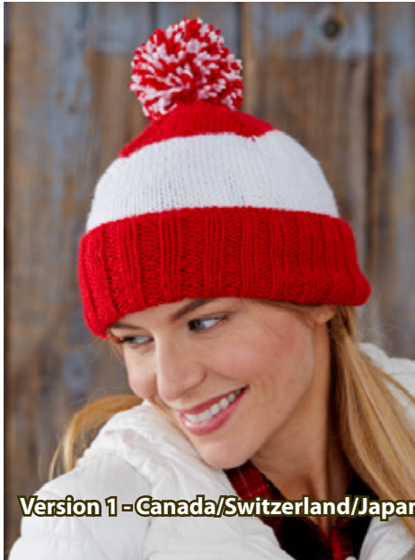
Version 1 - Canada/Switzerland/Japan