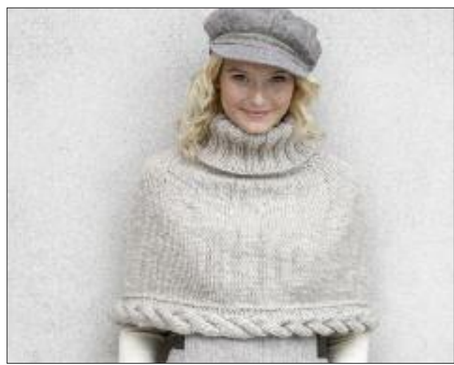
PATONS® CLASSIC WOOL ROVING CABLE CAPELET