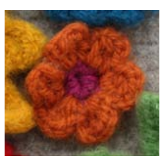
Flower 1 (Make 2 with D as Color 1 and C as Color 2. Make 2 with C as Color 1 and B as Color 2).