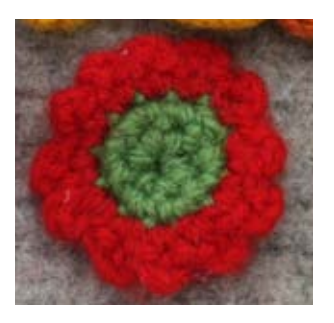
Flower 3 (Make 2 with B as Color 1 and E as Color 2. Make 2 with A as Color 1 and F as Color 2).