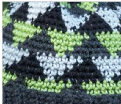
WS of Hat