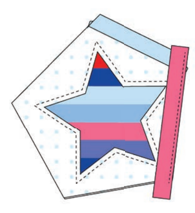
16. Add the next strip.