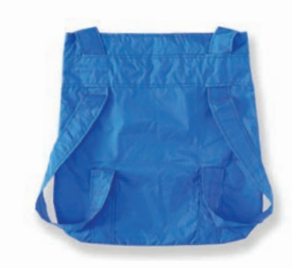
Pull handles down to use as back pack.