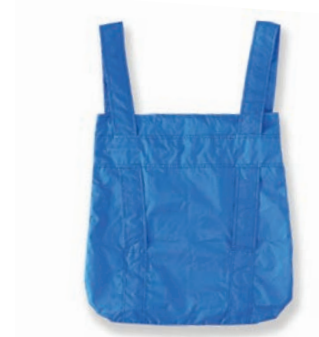
Pull handles up to carry as tote.