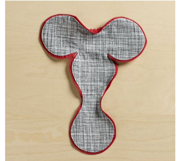
pattern template- page 3