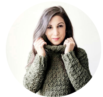
April Off The Hook Crochet Nook