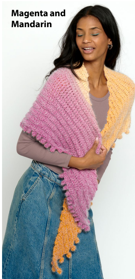
Magenta and Mandarin