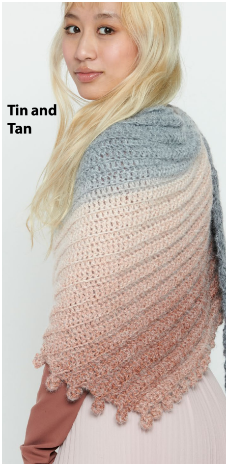
Tin and Tan