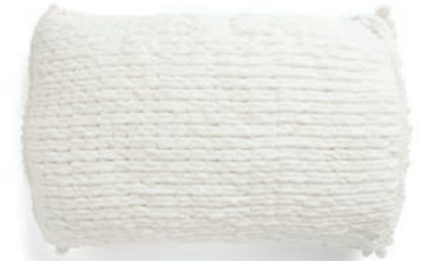
Version 2 Back