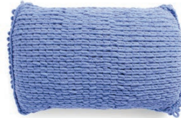
Version 1 Back