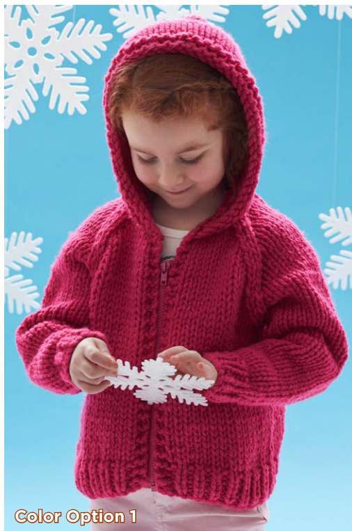
Color Option 1