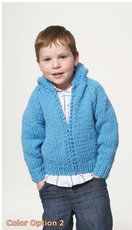
Color Option 2