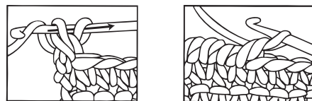
Reverse sc diagram

18th rnd: Ch 1. Working from left to right instead of from right to left as usual , work 1 reverse sc in each sc around. Join with sl st to first sc. Fasten off.