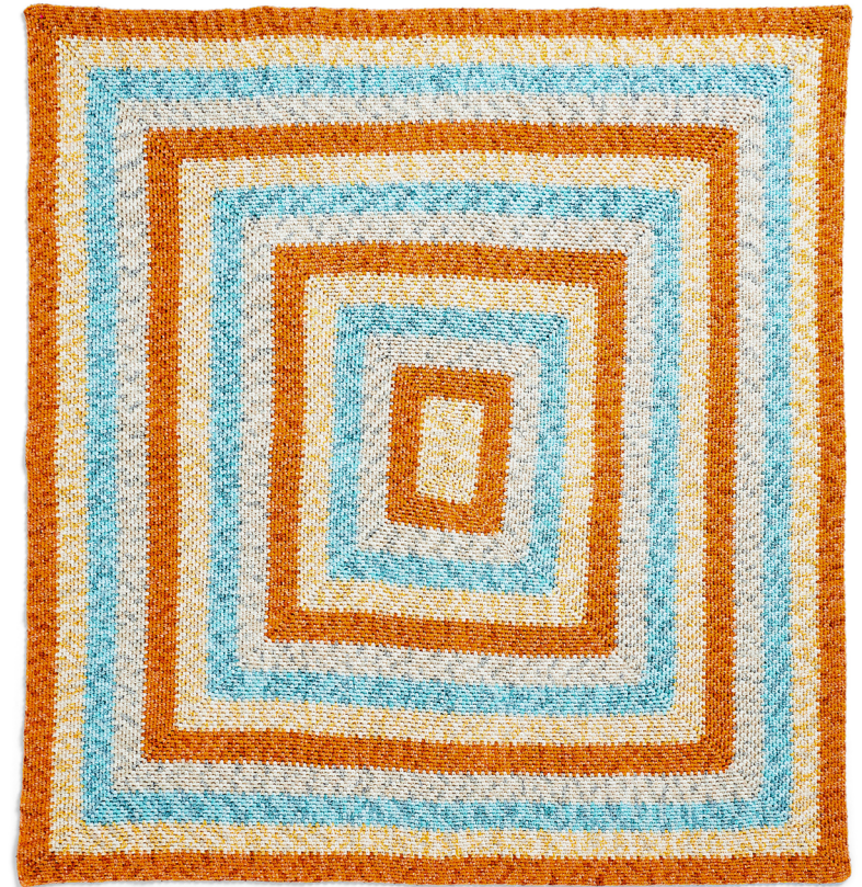
REDUCED SAMPLE OF BLANKET

STITCH KEY ○ = chain (ch) • = slip stitch (sl st) + = single crochet (sc)