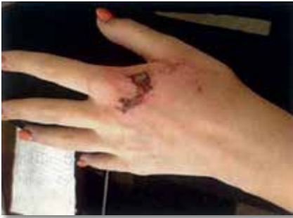
14 of February 2015