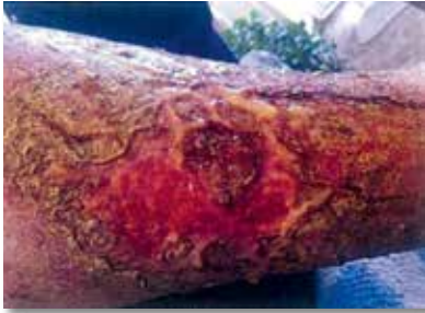
22 of December 2014