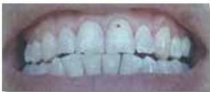
31 of Juli 2014