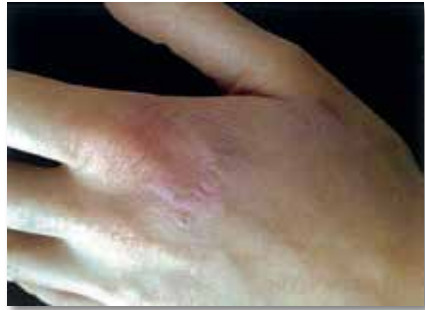
21 of February 2015