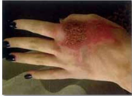
21 of February 2015