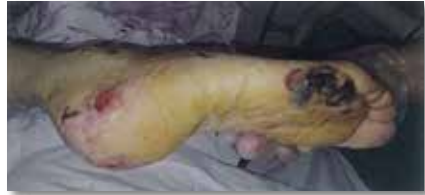
23 of September 2014