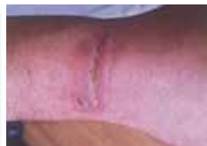
10 of February 2015