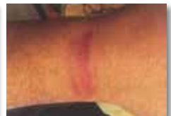
24 of February 2015