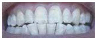
15 of September 2014