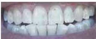
30 of August 2014