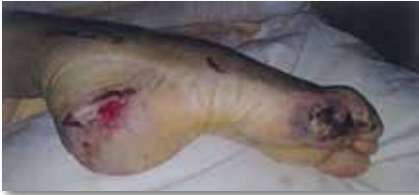
9 of September 2014