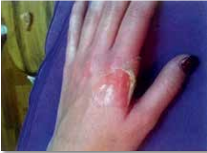
14 of February 2015