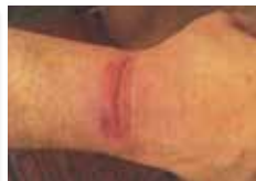
11 of February 2015