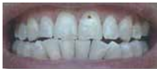
4 of August 2014