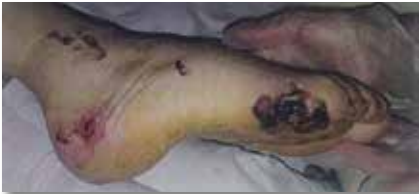
30 of September 2014