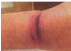
7 of February 2015