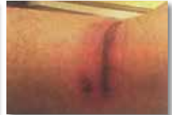
4 of February 2015