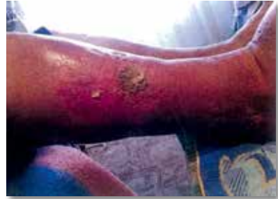
9 of February 2015