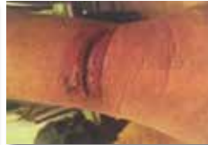
3 of February 2015