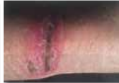
2 of February 2015