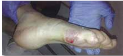
10 of October 2014