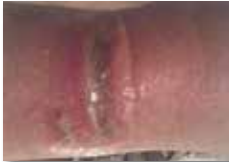
1 of February 2015