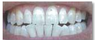
27 of August 2014