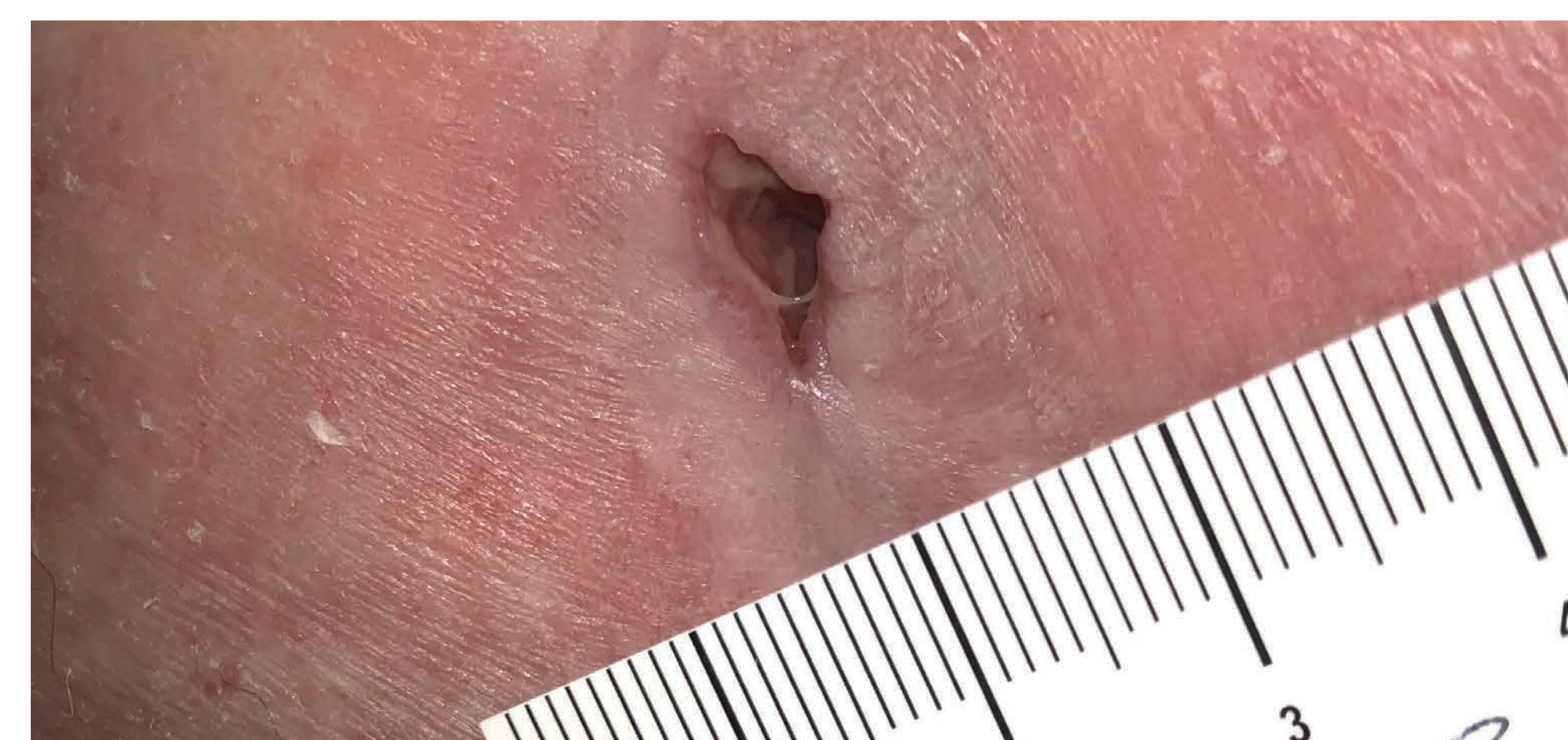
7/26/22 – McCORD TREATMENT