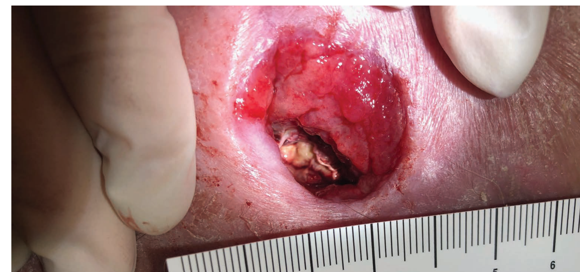
12/16/21 – PRE-TREATMENT