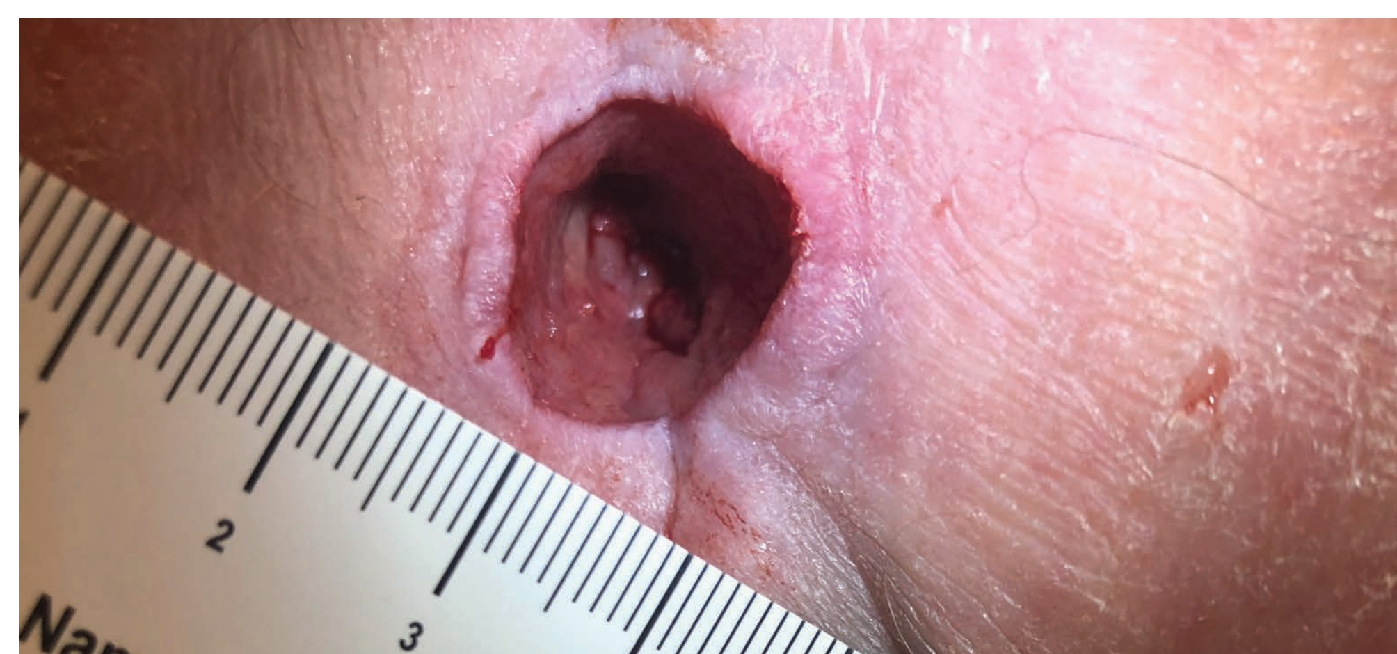
5/15/22 – McCORD TREATMENT