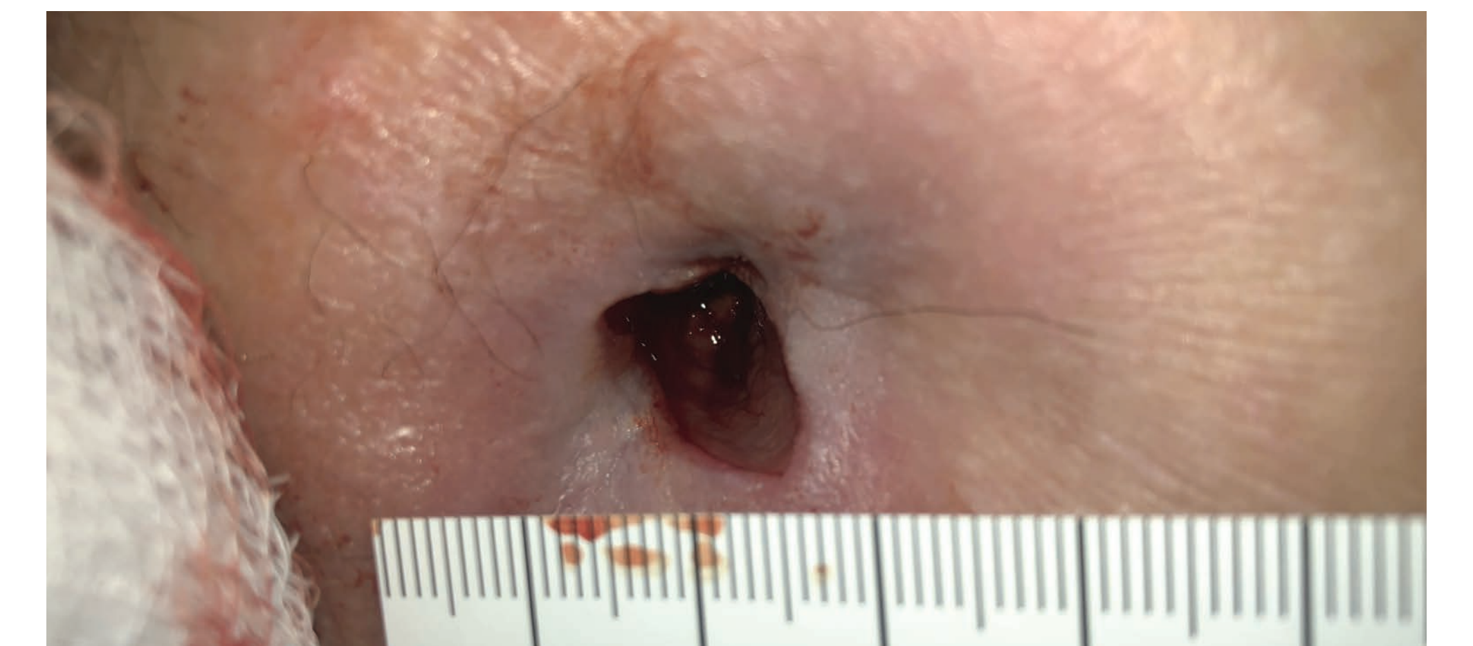
2/1/22 – PRE-TREATMENT